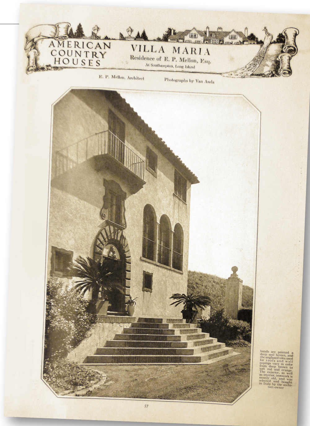
"American Country Houses," Country Life , August 1926.