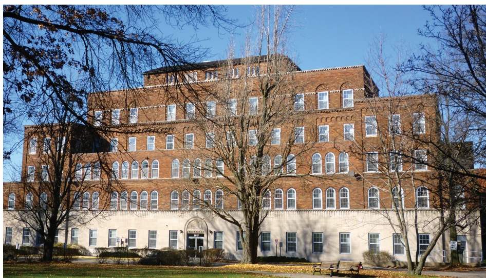
Main Hospital, former Tuberculosis League, 2827 Bedford Avenue, Pittsburgh.