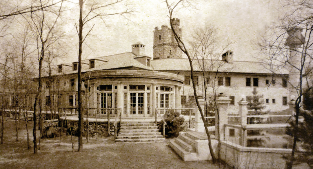
LEFT: Rolling Rock Club, 1921.