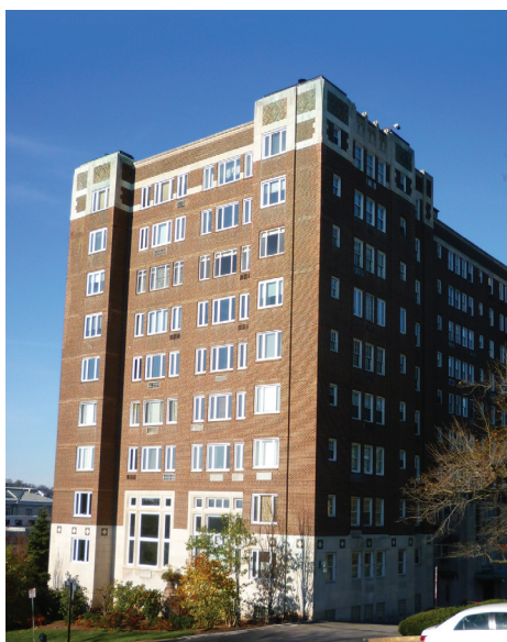
ABOVE: Park Mansions, 1927, at 5023 Frew Street.