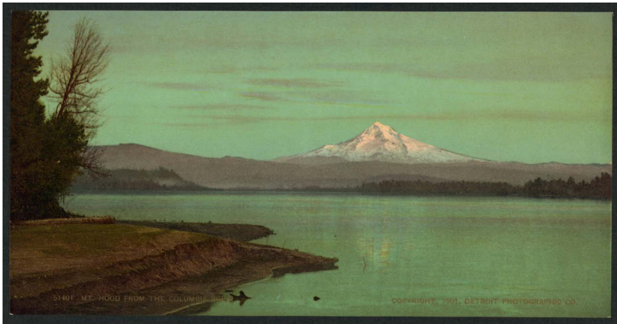
Fig. 8. Being among the highest peaks in the Northwest, Mt. Hood—like the other mountains in the Cascade Range—played a prominent role in the cultural geography of the regions native peoples.