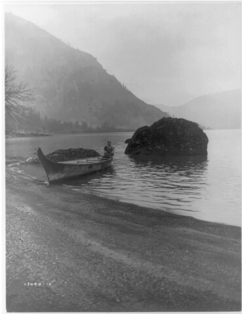
Fig. 4. The Columbia River was a critical means of travel, trade, and communication as well as an important source of sustenance for the Natives residing near its shoreline, and well beyond. Its rocky shoreline provided an important canvas on which various peoples could embed stories, myths, and laws. Curtis may have posed this Chinook man but the landscapes around him were authentic.

could “merely stand there,” having lost autonomy and position in their community and kinship network.