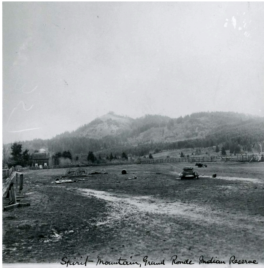
Fig. 9. Spirit Mountain is the most important spiritual site for the Kalapuyan peoples of the Willamette Valley in Oregon. Fortunately, although termination of the mid-20th century dissolved the tribe and reservation for about thirty years, the Kalapuyans were able to remain near the mountain after removal in the 1850s. Although a lumber company now owns Spirit Mountain, members of the Confederated Tribes of Grand Ronde continue to visit and it continues to sustain them physically and spiritually.