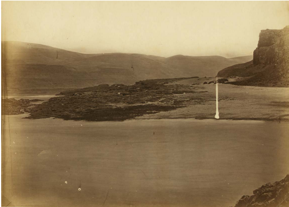
Fig. 5. The basalt cliffs carved out by the Columbia River east of The Dalles as mid-19th-century Indians would have seen them. The Indian residence near the shore was likely an Upper Chinookan or Sahaptin summer encampment, at which they fished for salmon and traded, communicated, and interacted with a variety of Native peoples thanks to reserved rights contained in their 1855 treaty to access traditional sites.