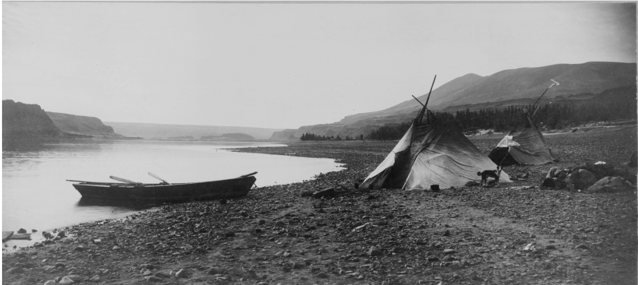
Fig. 1. The Home Guard—On the Columbia

The native peoples of Oregon and Washington were extensive readers well before contact with Euro-Americans. They read stories to their children and grandchildren, stories entertaining and frightening, which communicated proper values and behavior. They read to themselves and for the enrichment of others. They read the histories of their people and their neighbors. They read law. They read of the power of their God and of their, and the world's, creation. Like any important text, these stories were read over and over. Every facet of life, from natural occurrences and preternatural events to trade and human emotions, was relayed through texts and conveyed and augmented by each generation. Their lives abounded in texts, and they were literally surrounded by them. The texts resided—and still reside—in the landscapes upon which or in the shadow of which they lived and in the spaces and places they crossed, or didn't cross, inhabited, or avoided in their diurnal and seasonal movements.