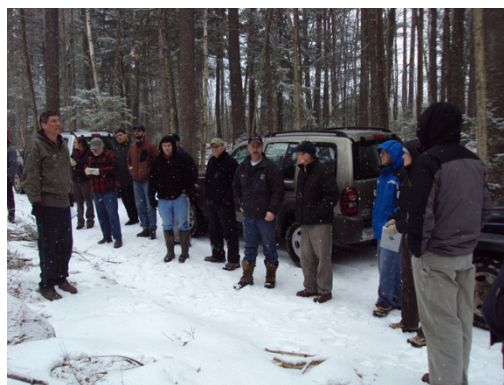
Tribal forest and natural resource managers meeting on the Menominee Indian forest for the Indian Forest Management Assessment Team, III site visit, February 2012.