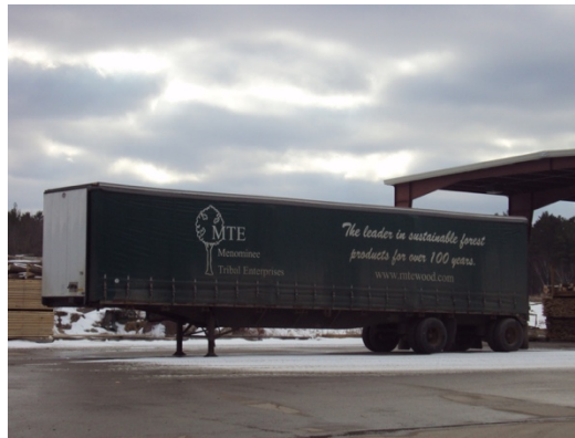
Menominee Tribal Enterprise proudly displays their motto on the side of a truck, “The leader in sustainable forest products for over 100 years.”