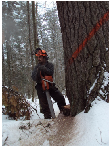
A tribal employee stands against a pine designated for single tree selection harvest. Uneven, aged silvicultural practices such as these promote forest health and sustainable harvest while providing economic opportunities for the tribe and individual tribal members.

Additionally, traditional ecological knowledge influences tribal natural resource management by the Salish and Kootenai tribes in Montana. These tribes have “burners” in their society who are tribal fire specialists. They are responsible for knowing fuel conditions and knowing when “to start a fire so that it would produce the desired results” (Mason et al. 2012). When burners stimulate low-intensity forest fires it creates uneven aged conditions and promotes healthy ecological forest conditions that are more indicative of pre-European times (Becker and Corse 1997). In addition to the Salish and Kootenai tribes, many other indigenous cultures see fire as a beneficial tool for maintaining productive, healthy ecosystems (Kimmerer and Lake 2001; Ray, Kolden, and Chapin 2012; Huffman 2013; Stan, Ireland, and Fule 2014).