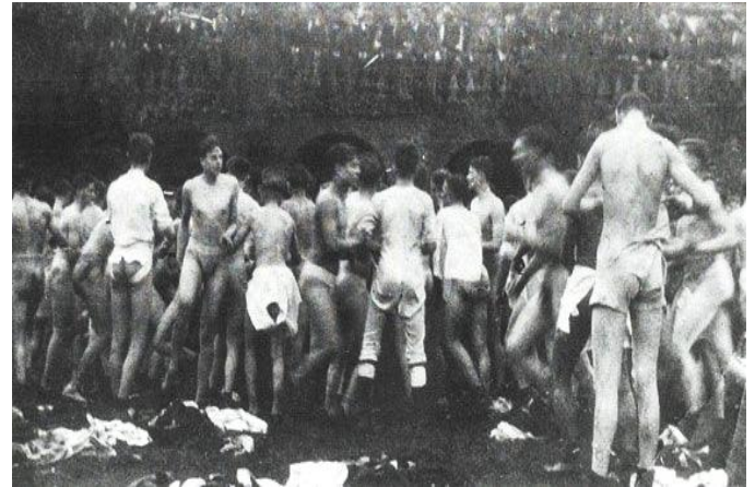
Figure 2.2: Students at the University of Pennsylvania engaged in the annual Pants Fight to show their class pride. 45

dangerous (sometimes resulting in concussions and broken bones) were routinely attended by faculty spectators who cheered and hissed at participants during the event. 43 It seems that university administrators and collegiates alike considered these organized fights as a natural part of manhood and as a way for new students to prove their worth as college men. 44