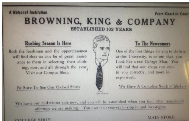
Figure 2.6: Advertisers used the image of the fraternity man to emphasize the importance of consumerism and appearance. 99

Some men regarded their fraternity membership to be a key marker of their masculine identity, granting them social prominence on campus. In The Plastic Age , Hugh Carver notes that his pin was “a sign that he was a person to be respected and obeyed; it was pleasant to be spoken to by the professors as one who had reached something approaching manhood.” 97 Since fraternity culture promoted material consumption, appearance, and social conformity, advertisers played off these ideas to convince college men to buy their products. 98