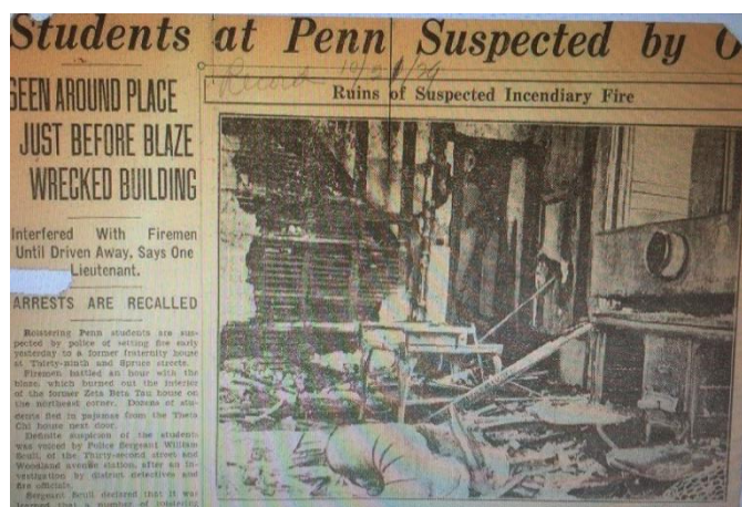
Figure 2.4: Students during the 1920s were brazen and rebellious. This photo shows the damage caused by student fires in 1929. 53

Pennsylvania increased in frequency over the course of the decade with one riot in 1920, two riots in 1928, and four riots in 1929. 49 Some students regarded these incidents as a source of amusement and an outlet for their pent up energy. 50 For example, in the aftermath of a riot in 1929, students justified their behavior by stating: “We didn’t have any fun for a long time.” 51 Thus, their pursuit of pleasure sanctioned the destruction of property and sometimes even led them to block authorities from controlling the situation. 52 As seen in the photograph below, students at the University of Pennsylvania were suspected of burning down a fraternity house and then jeering at firemen when they arrived on the scene.