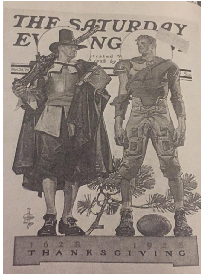
Figure 2.7: During the 1920s, football grew in importance and was seen as an All-American sport. 109 This cover of the Saturday Evening Post is reproduced in Oriard's, King Football: Sport & Spectacle in the Golden Age of Radio & Newsreels, Movies & Magazines, the Weekly & the Daily Press . 110

While football had already been an important part of college life, it became commercialized in an unprecedented manner during this era as college enrollment increased, and universities invested in expanding their athletic programs. 111 In preparation for future Yale-Harvard games, the Yale Bowl was constructed, a massive stadium that could seat 80,000 individuals (the largest stadium since the Roman Coliseum). 112 By