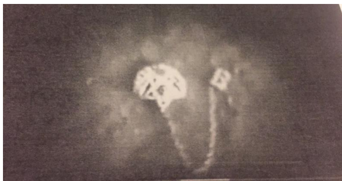
Figure 2.5: Scenes from movies of this era (such as this still from The Fair Co-Ed ) often featured a close-up of fraternity pins, as a way to indicate their importance to the audience. 96

Some men regarded their fraternity membership to be a key marker of their masculine identity, granting them social prominence on campus. In The Plastic Age , Hugh Carver notes that his pin was “a sign that he was a person to be respected and obeyed; it was pleasant to be spoken to by the professors as one who had reached something approaching manhood.” 97 Since fraternity culture promoted material consumption, appearance, and social conformity, advertisers played off these ideas to convince college men to buy their products. 98