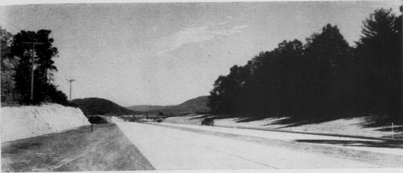
THE PENNSYLVANIA TURNPIKE, 1954

spire, is due in part to the fact that it succeeded where its last century forerunners failed. It pierced the Allegheny barrier, thus gaining access to Pittsburgh and the west. It achieved this end by means of tunnels originally planned to lead a railroad through the mountains, and in this manner it has provided the impetus to swing the pendulum in the other direction. Turnpikes are with us again, and in all probability they are here to stay.