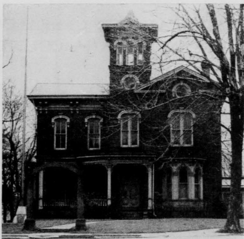
INDIANA MEMORIAL HALL

Headquarters of the Historical and Genealogical Society of Indiana County.