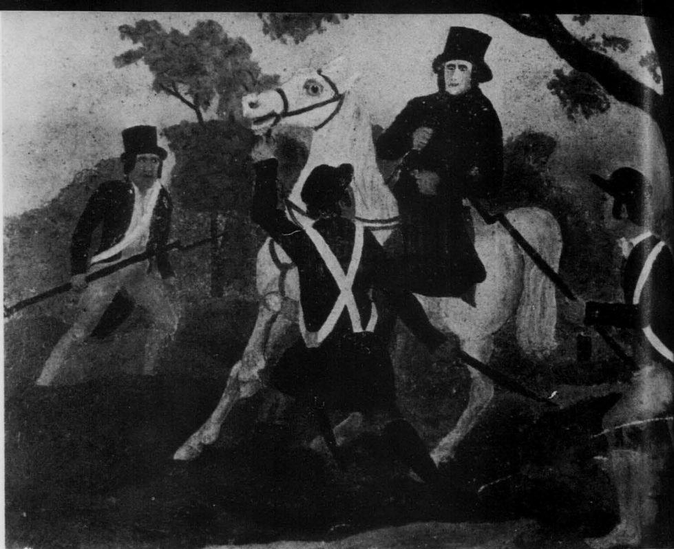
2. CAPTURE OF ANDRÉ (painted at age 12)— Louise C. Estill