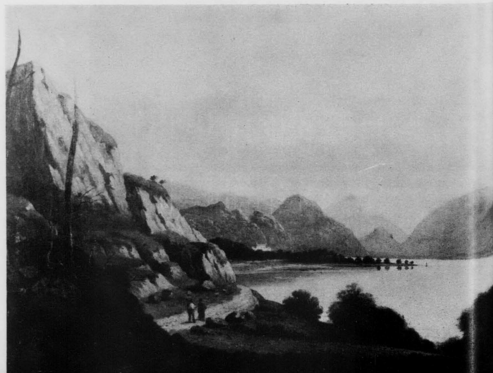
3. LANDSCAPE WITH LAKE— Louise C. Estill