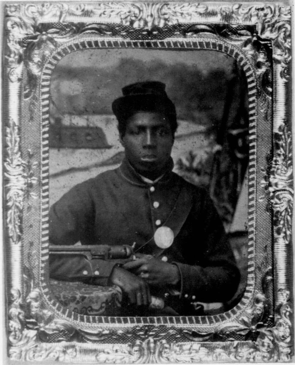
Unknown Union Soldier. Image reversed here. Photographer and date unknown. From Ken Burns' "The Civil War" (1990).