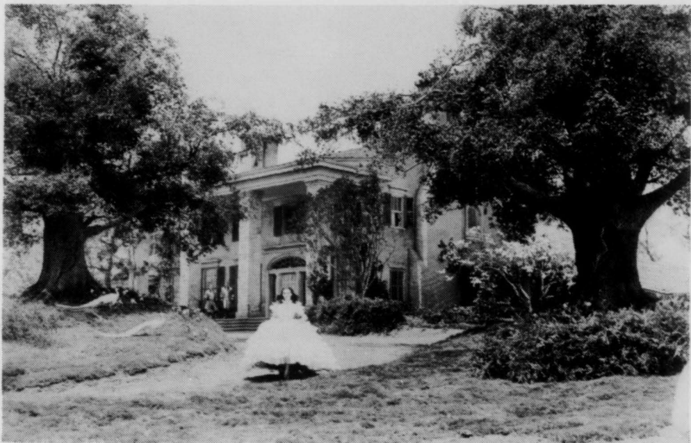
Southern Visions: Tara. The plantation mansion in David O. Selznick's "Gone With the Wind" (1939).