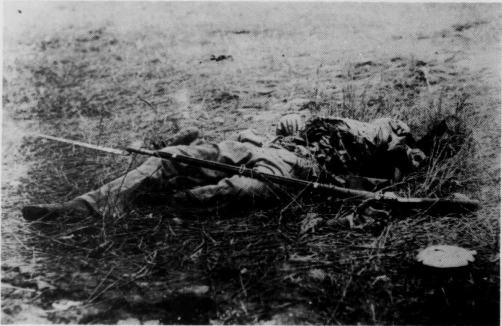
Dead at Gettysburg. From Ken Burns' "The Civil War" (1990).