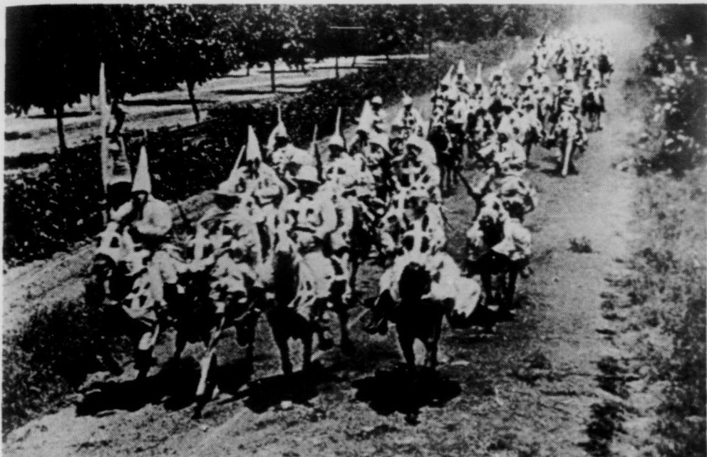
The KKK to the Rescue. The famed cavalry charge in D. W. Griffith's "Birth of a Nation" (1915).