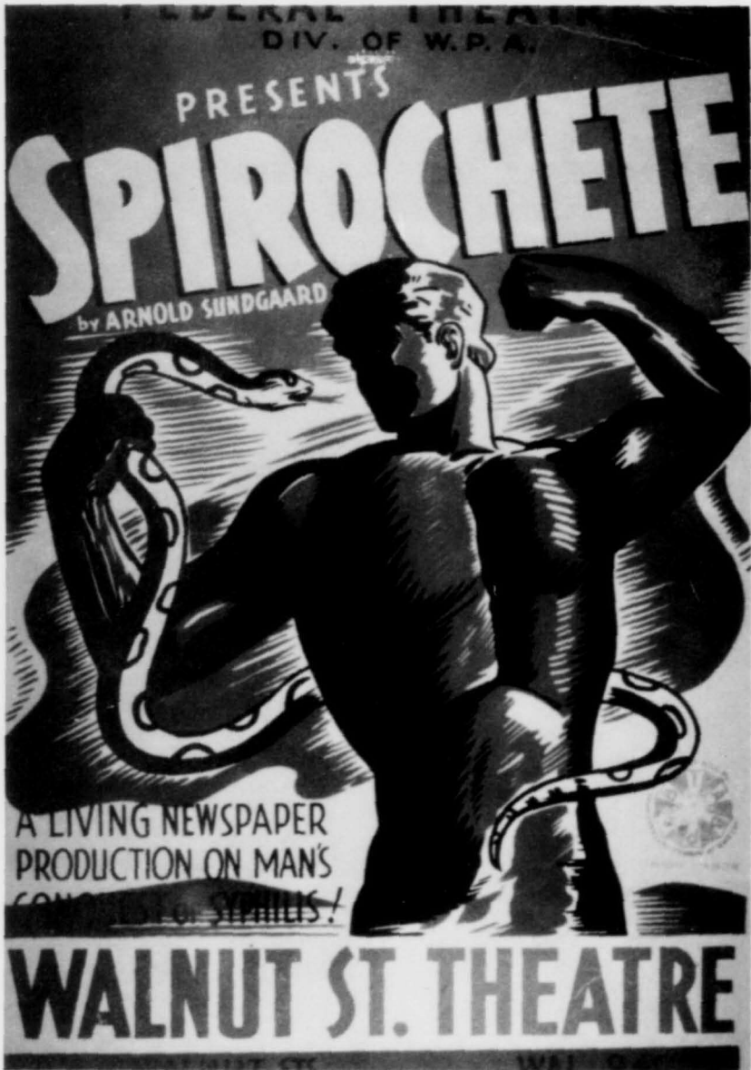
Philadelphia poster for "Spirochete".

Federal Theatre collection, George Mason University