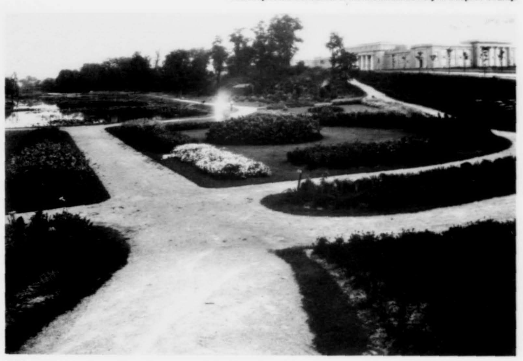
Italian Park Garden in Harrisburg, part of the Harrisburg "City Beautiful Movement."

Note: All photographs accompanying this article, courtesy of the Historical Society of Dauphin County.