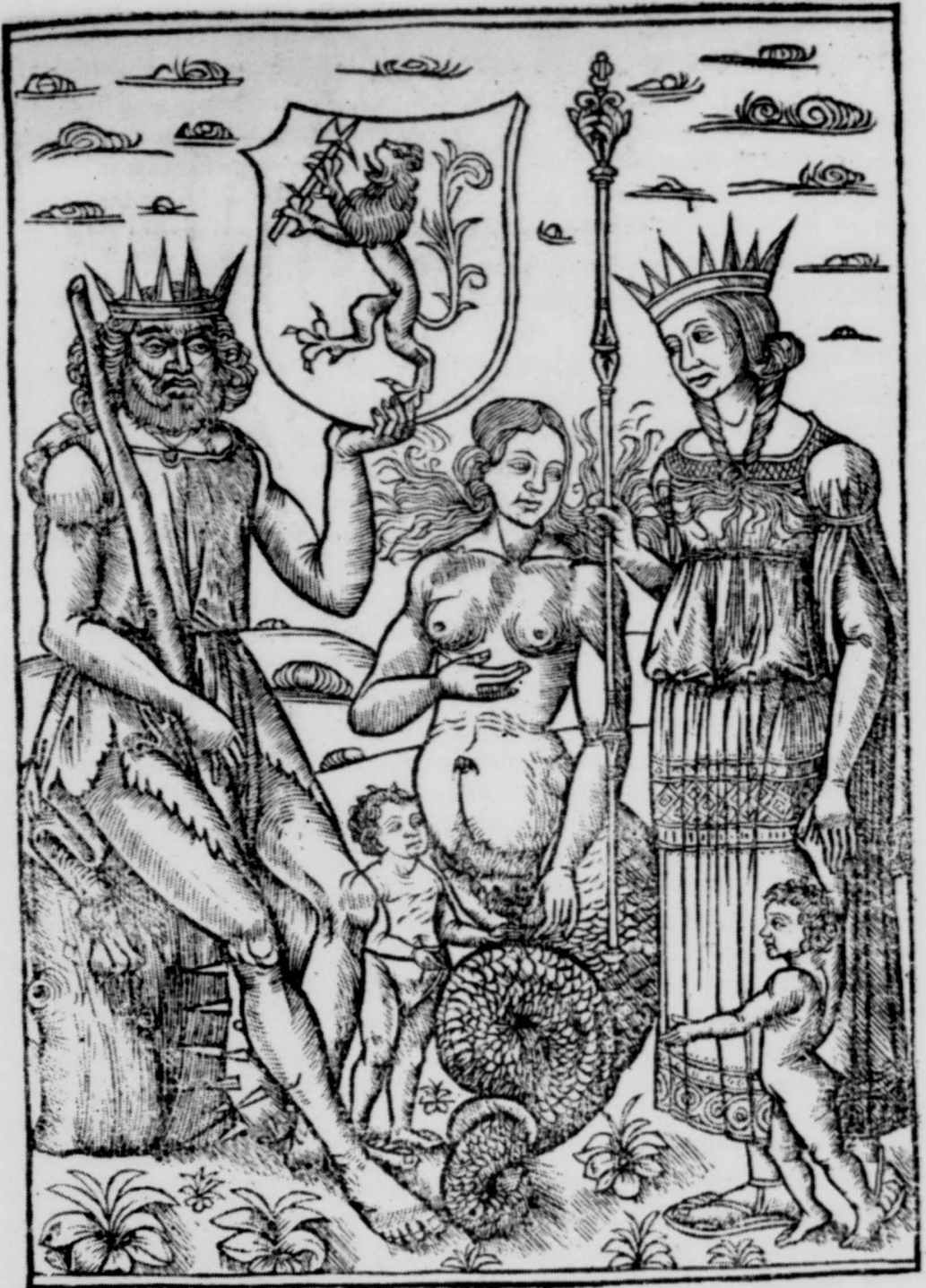
A Mackenzie brochure: Jean Lemaire de Belges. Les illustrations de Gaule . . . Paris, 1521.