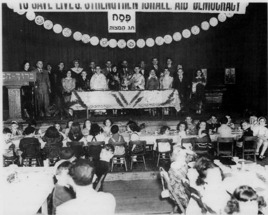
Model Passover Seder, Harrisburg Hebrew School, Harrisburg, Pennsylvania, 1951. The banner above the stage exhorts the community “To Save Lives, Strengthen Israel, and Aid Democracy.”