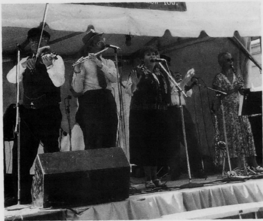
"Old World Folk Band," a klezmer revival band formed in 1982 and based in Harrisburg, Pennsylvania. The costuming of the band (hats and vests) makes references to Jewish roots in the Lower East Side at the turn of the century. In 1994 the band added Russian immigrants to the line-up (third and fourth from left). Here the band is performing at a cultural heritage festival in Lancaster, Pennsylvania, August 1997.