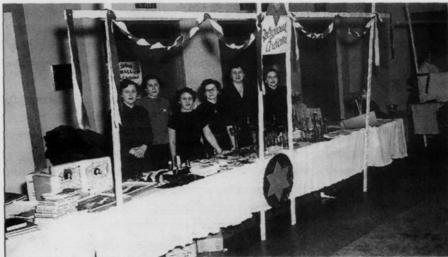
“Religious Articles” Booth at Family Night at Temple Beth-El (Conservative), Harrisburg, Pennsylvania, 1953. Behind the women is a poster advertising the “George Washington’s Birthday Ball” at the synagogue celebrating Washington’s public stance on religious tolerance for Jews in 1790.