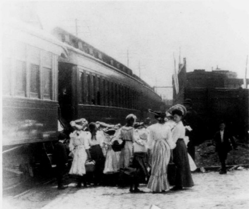
Boarding train for summer camp, 1906, Pittsburgh.