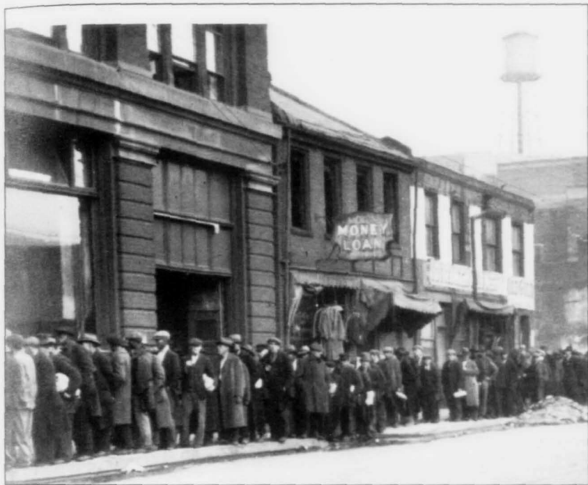
Great Depression bread line, Pittsburgh.