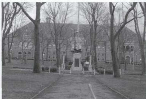
Carnegie Library of Homestead

Throughout much of its history, steel dominated areas like Munhall, Homestead and Braddock were under the control of the local steel mill management. As Miner pointed out, the first meeting of the Munhall Council was held at the Carnegie Land Company. The borough used company-supplied electricity and building supplies. The Coal and Iron Police, who brutally enforced the no-union mill policy, maintained law and order in the community as well. "Carnegie Steel continued to dominate civic life in Munhall for the first two decades of the twentieth century... Between 1898 and 1920, the lines between the interests of the company and the town became mired and more blurred. The company seems to be as concerned with shaping the lives of the workers as it was with making and shaping steel... Indeed, working people viewed Carnegie's philanthropies in the way they viewed most forms of welfare capitalism, i.e. as company public relations and as attempts to appease and distract them." 30