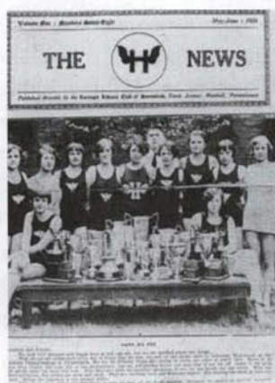
Athletic Club Newsletter (Carnegie Library of Homestead)

By this meeting, by your welcome, by these smiling faces, all regretful thoughts, all unpleasant memories, are henceforth and forever in the deep bosom of the ocean buried.... This building, which