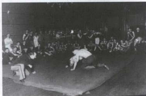
Library Athletic Club Wrestling Match, early 1900s.

Carnegie's rags to riches story is well known, including the infamous 1892 Homestead strike which was to haunt him until his death in 1919. In 1889, Carnegie expounded his thoughts on the sharing of riches in a book titled The Gospel of Wealth . "The problem of our age is the proper administration of wealth, so that the ties of brotherhood may still bind together the rich and the poor in harmonious relationship." 4 Writing that "The man who dies thus rich dies disgraced." 5 He indicated three ways to dispose of wealth: leaving it to heirs (which would not necessarily be spent well), bequeaths for public purposes (which may or not be allocated how one wished), or (as he favored)