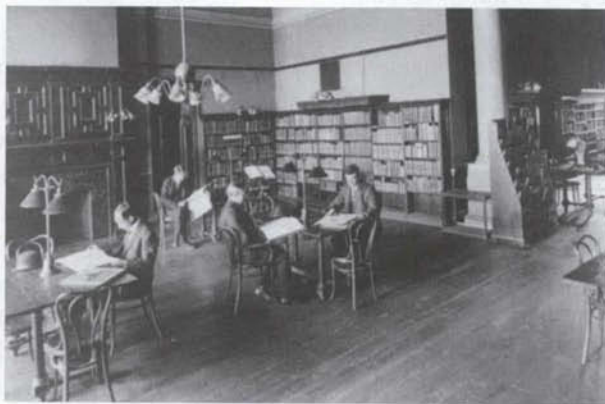
Reference and Reading Room, early 1900s.

Eventually, the Friends refurbished the Children's Room, established a young adult collection and section for reading aloud books. They also helped to coordinate President's Night where community service clubs, such as Rotary, Kiwanis, Lions, Optimists, etc., met in the Library for dinner during Children's Book Week. Many of the friends donated gifts of money, books,