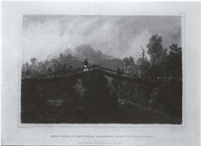
FIGURE 1: After Thomas Cole, Head Waters of the Juniata Alleghany Mountains, Pennsylvania , 1831, color engraving, 4 3/8" x 6 3/8", Fenner Sears & Co., published February 1, 1831 by I.T. Hinton & Simpkin & Marshall, London.