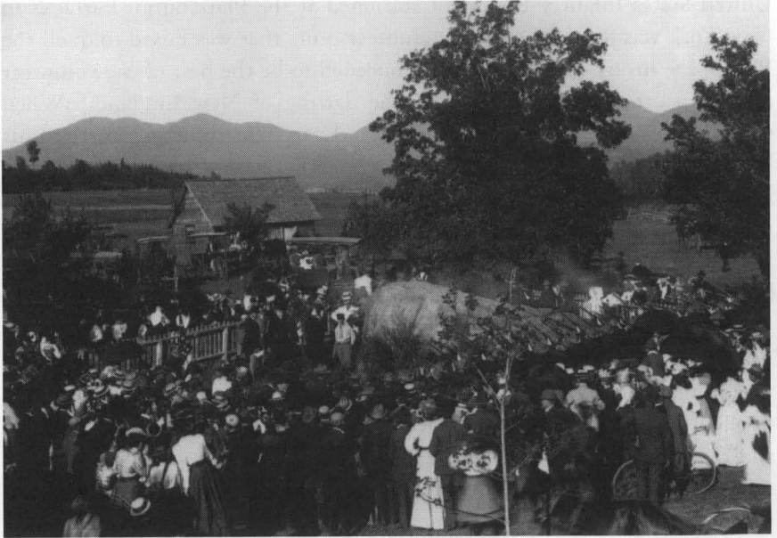
FIGURE 6: Reinterment on the John Brown Farm on August 30, 1899, of the remains of eight of John Brown's men killed at Harpers Ferry in 1859. The men were buried beside the huge boulder at the center. Note the raised rifles of the military contingent firing a volley over the grave.