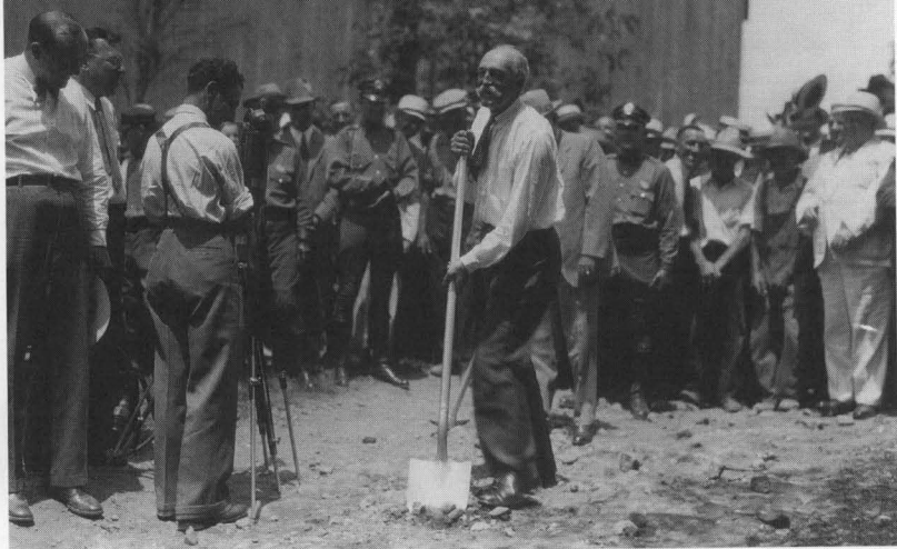
Governor Gifford Pinchot at a groundbreaking ceremony for a new road in York, one of many that came to be called "Pinchot roads."