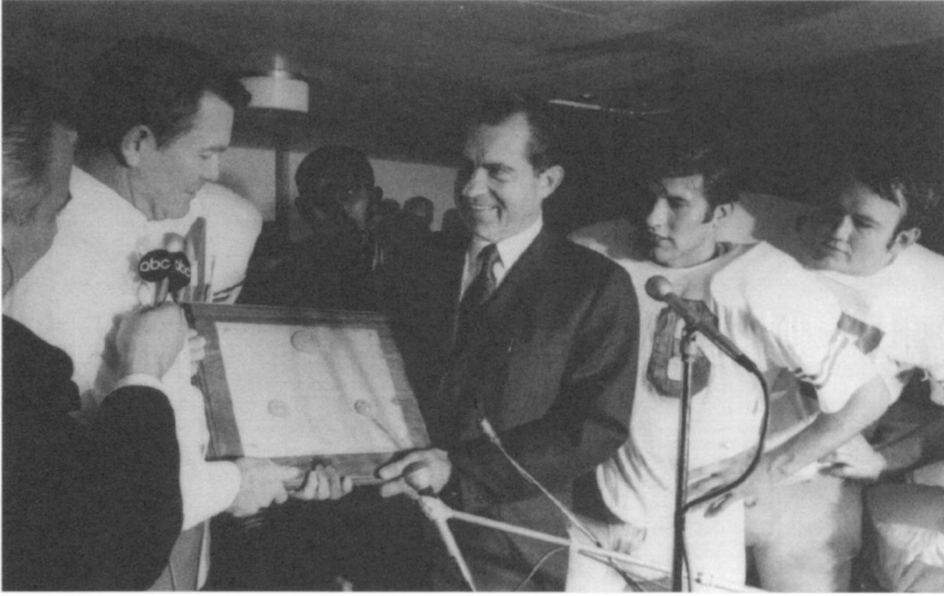
NIXON AND THE LONGHORNS: Nixon presented Texas head football coach Darrell Royal with his presidential plaque in the Texas locker room on live national television. This image of Nixon and Royal appeared on the front pages of newspapers all over Texas and across the country. H.R. Haldeman, Nixon's chief-of-staff, thought the White House had achieved a major public relations victory for the President.