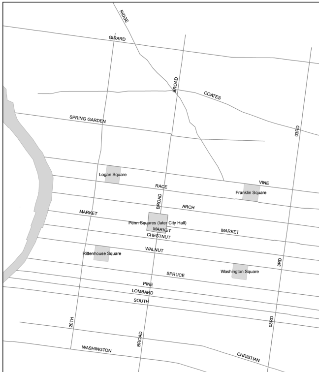
FIGURE 1: Philadelphia, 1850, showing major streets and public squares. Prior to 1854, the boundaries of the city proper extended from the Delaware River, just beyond the eastern ( right ) edge of the map, to the Schuylkill River in the west ( left ), and from South (or Cedar) Street to Vine Street. Horse-drawn freight cars carried their loads along Broad and Market, the two widest streets in the city proper. The Pennsylvania Railroad's depot stood just over the Schuylkill in West Philadelphia, but the corporation spent much of the 1850s trying to find a more direct route to the Delaware waterfront (not shown, east of Third Street). After establishing a freight depot just east of Penn Square in the 1850s, it eventually acquired land below Washington Avenue on the river. Its decision to move to such a southerly location upset civic boosters who wanted the railroad to tunnel under Callowhill Street (one block north of Vine) and erect a grand passenger terminus on Broad. The city's economic elite by midcentury had begun to move out of the old downtown east of Washington Square to the likes of Rittenhouse Square, Spring Garden (above Logan Square), and over the Schuylkill River in West Philadelphia. Booster journals like Morton McMichael's North American and United States Gazette invested Broad and Market streets—the two widest in the city—with totemic power, seeing them as “the reflex and image of the mighty city in which they are located.” With the avenues cast as a form of symbolic capital, hiding the freight that would fund their embellishment from public view became all the more important.