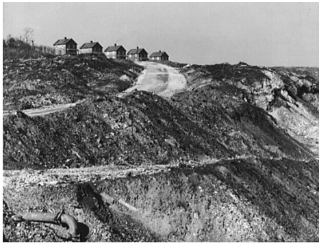
FIGURE 15: Slag piles beneath company town near Montour No. 4 mine of the Pittsburgh Coal Company, Washington County, Pa., 1942. Pennsylvania's iron furnaces produced a huge volume of molten slag—impurities that separated from iron during the smelting process—which was drained out of the furnace, cooled into solid pieces, and then dumped, sometimes piling into huge mounds.

Pennsylvania's environmental history also provides students the opportunity to think about the complex cocktails of synthetic chemical compounds that continue to impact the state's ecosystems—and our bodies—in ways not yet adequately measured or understood. Today, Pennsylvania residents are exposed to emissions from thirty-eight coal-fired powerplants within the state and reside downwind from dozens of regional coal plants in Ohio and West Virginia. In 2010 eighteen counties received a grade of F for short-term levels of pollution, five out of six Pennsylvanians lived in metropolitan areas that still received a failing grade for air quality, and Pittsburgh still had air quality ranked among the worst of any major city in the nation. As of February 2010 Pennsylvania contained ninety-five active Superfund sites—trailing only New Jersey (112) and California (96). 16 Today, it is tremendously difficult to understand these environmental issues because the very visible and odiferous pollutants of previous generations have been replaced by new, less obvious substances. 17