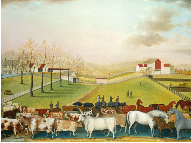
FIGURE 2: Edward Hicks, “An Indian summer view of the Farm and Stock OF JAMES C CORNELL of Northampton Bucks county Pennsylvania,” 1846. In this painting, Hicks beautifully captured the richness of Pennsylvania’s farm economy in the early 1800s. Behind the prize-winning livestock—their place in the foreground indicating their importance—one can see the large stone farmhouse, massive barn, full corncribs, and an orchard and wood lots in the background.