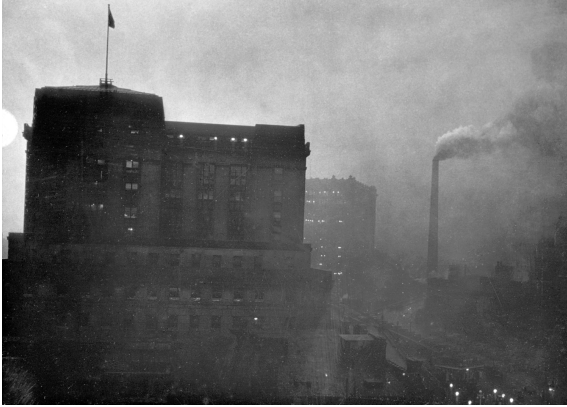
FIGURE 13: “Midday darkness,” Pittsburgh, Pa., circa 1940. In the mid-1800s Pittsburgh’s famous smoke-filled skies were a symbol of its thriving businesses and economic promise. By the early 1900s, however, smoke pollution from its steel mills and other industrial plants was so bad that the city suffocated for days beneath darkened skies.