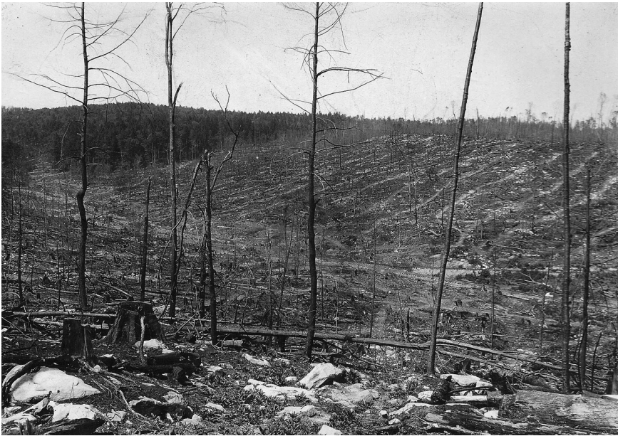
FIGURE 16: Photograph of cut over lands, taken by Hugh Baker of the Penn State Department of Forestry, Hicks Run, Pa., 1911. This photograph of lands recently harvested of virgin hemlock and hardwoods well documents the deforestation of much of Pennsylvania in the late 1800s and early 1900s. (Courtesy of the author.)

Pennsylvania also provides a rich canvass for assessing the ability of renewable natural resources and ecosystems to recover from human impact. A hundred years ago the Commonwealth was plagued by barren and devastated landscapes, impoverished ecosystems devoid of previously abundant species of flora and fauna, and some of the most polluted water and air in