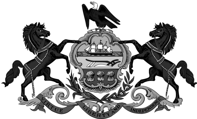
FIGURE 1: Pennsylvania Coat of Arms. After declaring independence the state of Pennsylvania placed a plow and a merchant ship on paper money (1777) and then in its coat of arms (1778) to symbolize the two principal sources of the Commonwealth's wealth: agriculture and commerce.

Blessed with a temperate climate and rich soils, the colony of Pennsylvania grew rich on its farms. Students can engage in historical detective work by analyzing images of the Pennsylvania colonial coat of arms (which replaced helmet, shield, and dragon with plow, sheaf, and ship), the colonial grain mills that still dot the Commonwealth's landscape, its rich farmsteads, and the iconic Pennsylvania bank barn to understand what made Pennsylvania the breadbasket and meat provisioner of North America.