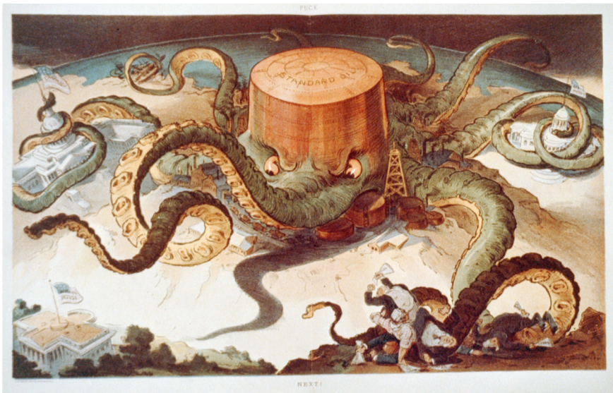
FIGURE 12: “Next!”, Puck Magazine , 1904. This political cartoon well demonstrates American fears about the Standard Oil Company’s vast and growing power over government. With arms already wrapped around the steel, copper, and shipping industries, the U.S. Capitol, and a state capital building, the Trust stretches out yet another tentacle over the White House. Back in 1881, Henry Lloyd Demarest quipped in the Atlantic Monthly that “The Standard has done everything with the Pennsylvania legislature, except refine it.”