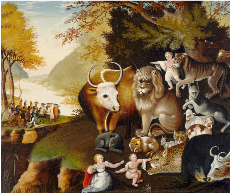
FIGURE 4: Edward Hicks, Peaceable Kingdom, circa 1834. In the early 1800s Edward Hicks rendered William Penn’s Quaker vision of a Holy Experiment in his Peaceable Kingdom paintings. In this version, Hicks paired his allegory of different species living together in harmony with the story of William Penn’s fabled meeting of friendship with Lenape Indians in 1683.