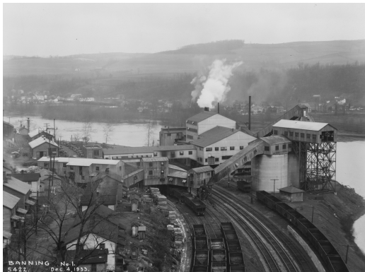
FIGURE 9: Banning No. 1 Mine of the Pittsburgh Coal Company, Perryopolis, Pa., 1933. In the early 1900s American railroads used millions of tons of Pennsylvania coal each year. To get a sense of the scale of coal use by Pennsylvania railroads see the photograph of the Bridgeport Coal Station, circa 1920, on ExplorePAhistory.com.