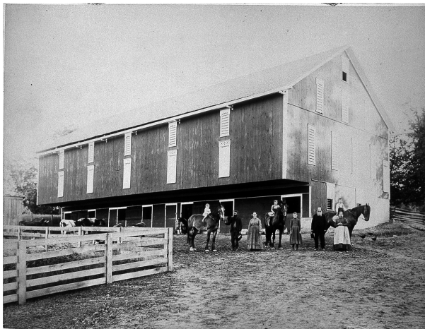
FIGURE 3: Farmer and wife in front of their barn, somewhere in Pennsylvania, circa 1890. The Commonwealth’s most distinctive architectural form, the Pennsylvania barn served many functions. Large barns, like the one pictured here, speak to the great productivity of farms across the state.