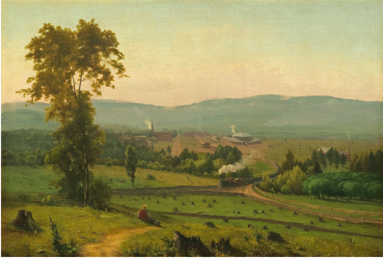
FIGURE 5: George Inness, The Lackawanna Valley , circa 1855. Commissioned by the president of the Delaware, Lackawanna, and Western Railroad, Inness's The Lackawanna Valley is one of the most famous and highly discussed nineteenth-century American paintings of the impact of industrialization upon the natural world and the complex relationship between the two.

Pennsylvania's agricultural bounty was matched by the abundance of its other natural resources. The vast forests and extensive deposits of iron ore, anthracite and bituminous coal, and oil transformed Pennsylvania into an industrial powerhouse. Nowhere in the United States can the history of energy regimes—the sources of energy that fuel our lives and economies—be better told than in Pennsylvania. The Commonwealth was home to more than 95 percent of the anthracite coal in the Western Hemisphere and vast deposits of bituminous coal, the birthplace of the world oil industry (Titusville 1859), the first successful three-wire electric lighting system in the United States (Sunbury in 1883), the world's first large-scale nuclear powerplant (Shippingport, 1957), and the nation's worst nuclear accident (Three Mile Island, 1979). And it was its location at the confluences of three rivers and its proximity to the Pittsburgh seam, a vast deposit of bituminous coal that produced the nation's best coking coal, which enabled Pittsburgh to become the steel capital of the world. 5