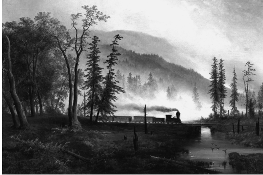
FIGURE 8: Scene on Bear Creek, Woods on Fire , by Gustav Grunewald, 1848. In the 1800s railroads were a major cause of forest fires. Sparks and cinders flying from the stacks of passing locomotives burned tens of thousands of acres to the ground. In 1848 Bethlehem artist Gustav Grunewald painted this scene of a train on the Lehigh and Susquehanna Railroad passing through a forest fire near Bear Creek, a remote location southeast of Wilkes Barre. (Courtesy of the Payne Gallery of Moravian College, Bethlehem, Pa.)

The British steam locomotive was first introduced into the United States to carry coal in northeastern Pennsylvania, and it was coal that soon fueled the fire-breathing—and forest-fire-starting—iron horses that collapsed time and space, and integrated previously isolated areas into the surging industrial economy. An ever-spreading network of railroads then laced its way through