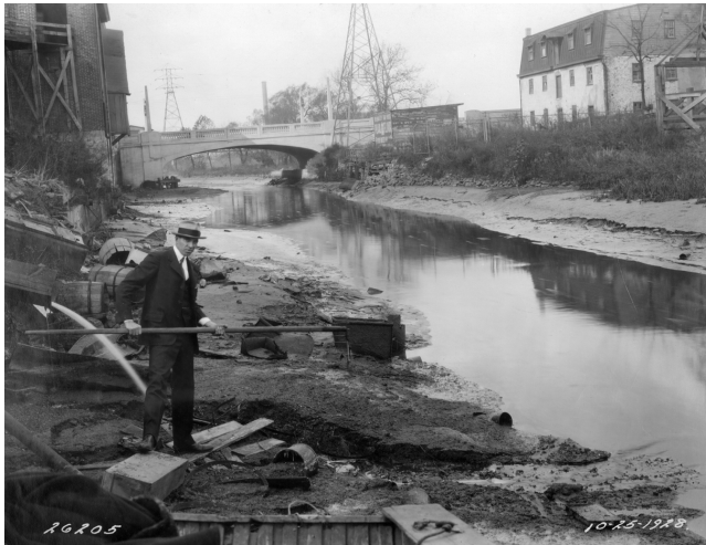
FIGURE 14: Wastes dumped into the Bridgeport Canal, Bridgeport, Pa., October 25, 1928. In the late 1800s and early 1900s Philadelphia had some of the nation’s most polluted rivers and worst public water supplies. This 1928 photo shows wastes in the Bridgeport Canal below the outlet of March Packing Company. The Canal fed into the Schuylkill River, from which Philadelphia received much of its drinking water.