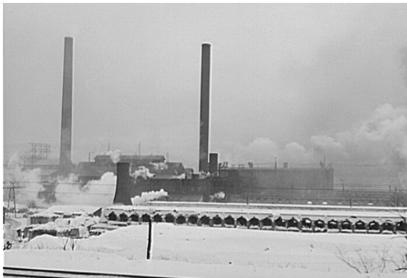
FIGURE 7: Beehive coke ovens in front of steel mill, Aliquippa, Pa., 1941. The roasting of bituminous coal in Pennsylvania's beehive coke ovens, more than 46,000 of which were operation in the 1910s, poured huge clouds of toxic smoke into the air twenty-four hours a day, 365 days a year. The chemical cocktail of tar, benzene, lead, sulfur dioxide, and more than a thousand chemical compounds poisoned the surrounding landscape and caused untold illnesses among coke workers and residents of Pennsylvania coal country.