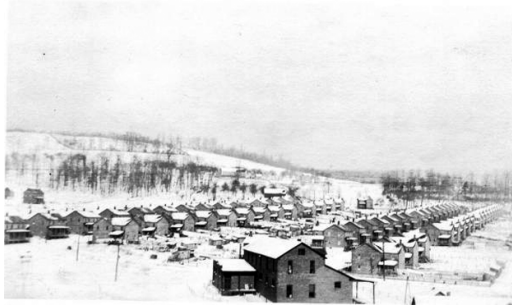
FIGURE 11: Company-owned housing near Eureka Mine 37, Windber, Pa., circa 1920. This winter photograph of housing owned by the Berwind-White Coal Company captures the isolation of the coal-patch towns erected by mine companies during the coal boom of the nineteenth and early twentieth centuries.