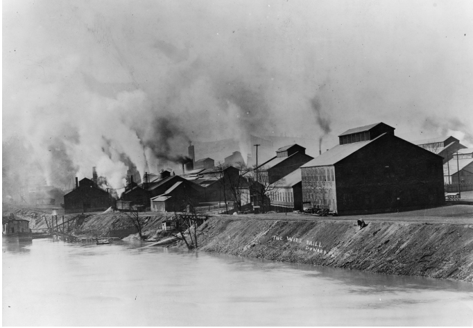
FIGURE 6: Wire mills spewing smoke along the Monongahela River, Donora, Pa., 1910. The industrial pollution in and around Pittsburgh culminated in the Donora Smog of October 29, 1948, when a temperature inversion in this small town thirty-seven miles south of Pittsburgh killed twenty-one people and caused 40 percent of the town to become sick. Investigations by the state of Pennsylvania, U.S. Bureau of Public Health, and United Steelworkers led to the passage of the first state and federal laws against air pollution.