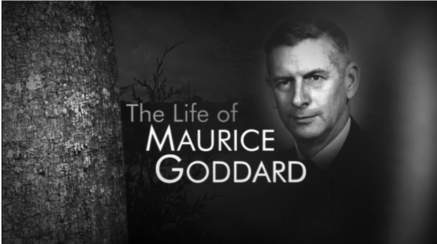
FIGURE 3: Trailer for the documentary on the life of Maurice K. Goddard.

portrayed Goddard as an inspirational leader who had a big vision; who accomplished his goals with professionalism, integrity, and hard work; and who always placed the public interest first.