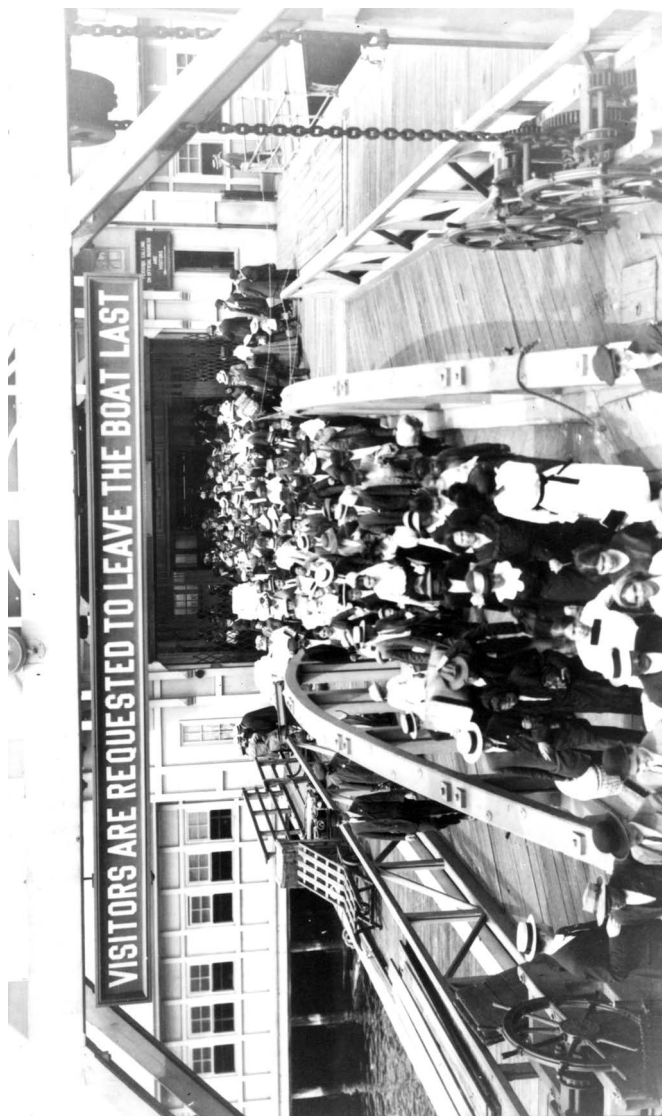
FIGURE 6: Ellis Island, New York, September 3, 1913. Image by T. V. Powderly.