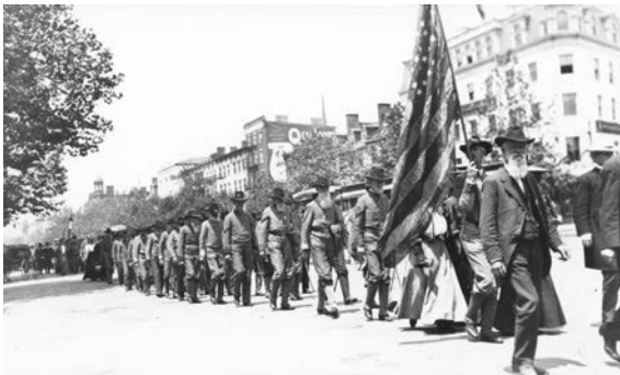
FIGURE 13: Confederate veterans parading in DC with American flag, June 8, 1917. 251658240.