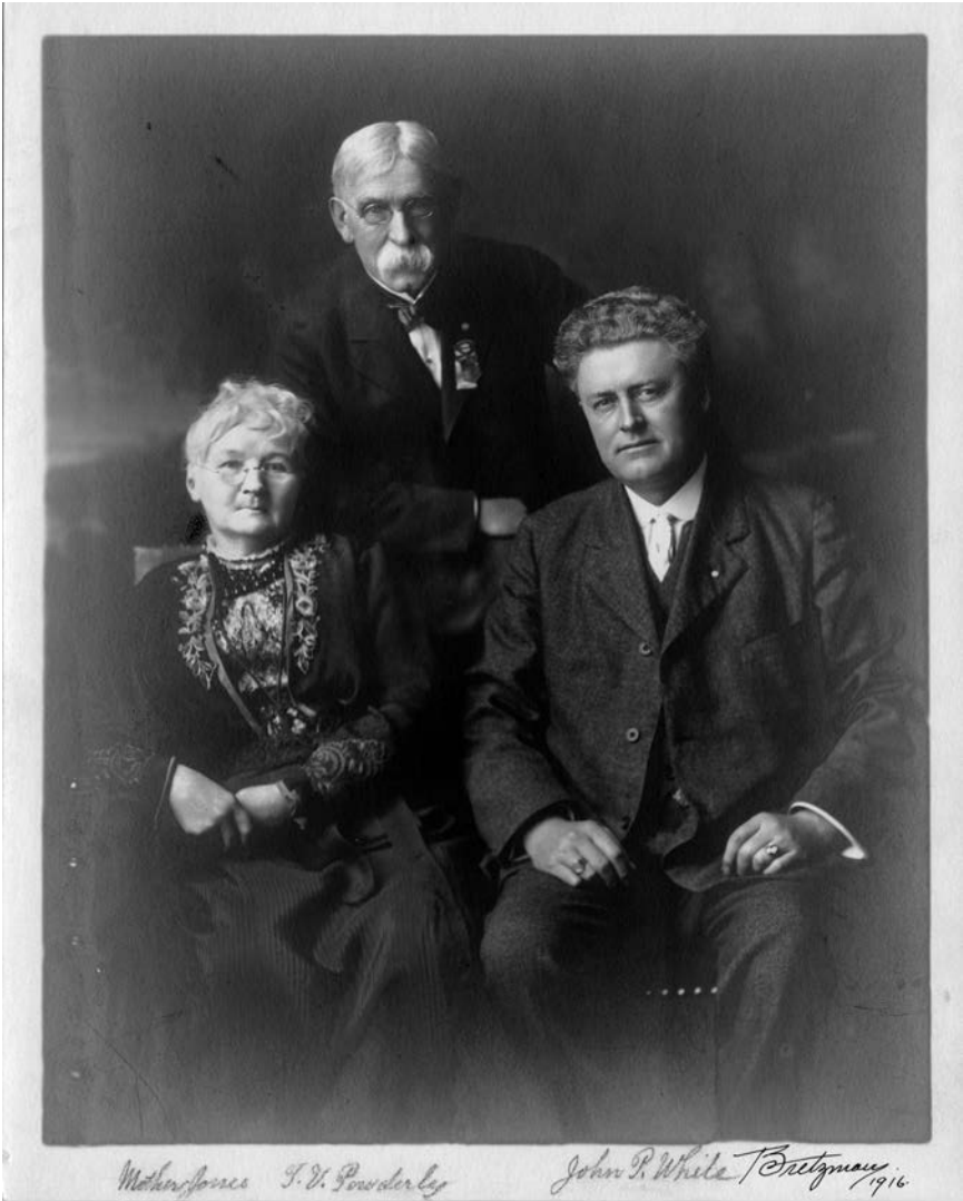
FIGURE 11: Powderly, with “Mother” Mary Harris Jones and John P. White, UMWA president, 1916.

home until his death, which was probably his favorite place to photograph. Having moved to the District in 1897, Powderly had obtained a three-story Queen Anne-style house in the Petworth area, a residential neighborhood in Northwest Washington bounded by Georgia Avenue to the west, North Capitol Street to the east, Rock Creek Church Road to the south, and