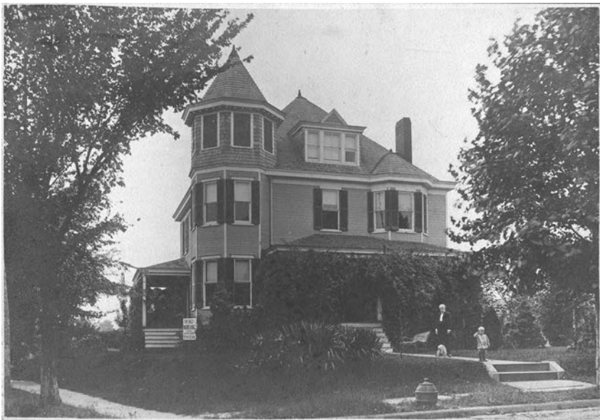
FIGURE 16: Powderly house at Petworth, Washington, DC, 1903.

Powderly was also active in 1904 in leading the Citizen's Association in supporting the Policemen's Association's efforts to secure pay increases via congressional action. There were also complaints (eerily familiar in the twenty-first century) that the new streetcar service did not run frequently enough or provide enough seats. 21 Powderly also used his position as a platform to advocate for home rule. In a July 4, 1908, speech at the Soldier's Home he also advocated the rights of Washington residents, including women, to vote, basing his theory on the Fifteenth Amendment to the Constitution stating that nothing could alter the fact that they were citizens of the United States (see fig. 17). 22