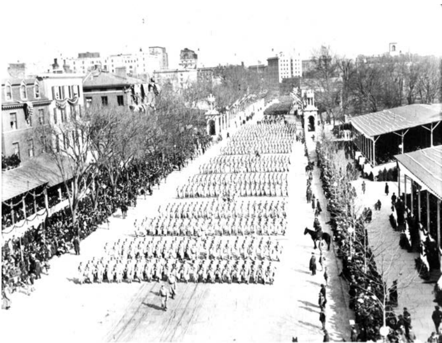
FIGURE 9: First inauguration of Woodrow Wilson, parade, DC—March 4, 1913.

During these years Powderly maintained ties to labor leaders such as Mary "Mother" Harris Jones (1837–1930), the Irish-born "Miner's Angel" who was