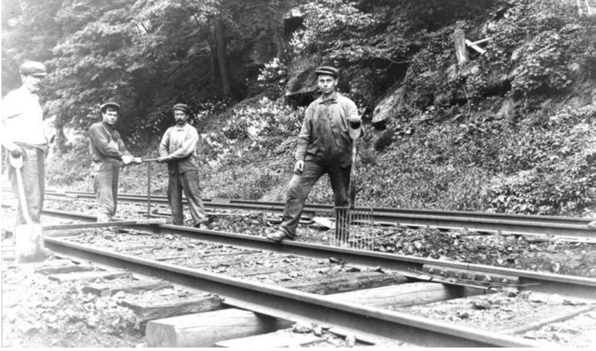
FIGURE 4: "Italian Laborers." Delaware Water Gap, Pennsylvania, May 27, 1913. Image by T. V. Powderly.

that included the establishment of a board of health, a sewage system, food inspection, and paved roads (see fig. 5). 10