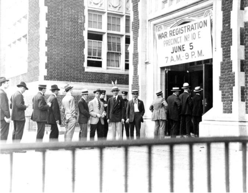
FIGURE 14: Draft registration, DC (0286-13), June 5, 1917. Image by T. V. Powderly.