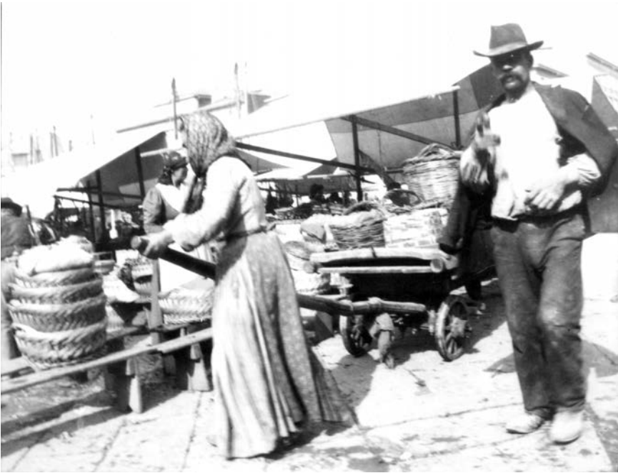
FIGURE 8: Scene in market, Trieste, Austria (now Italy), ca. 1906–1907.