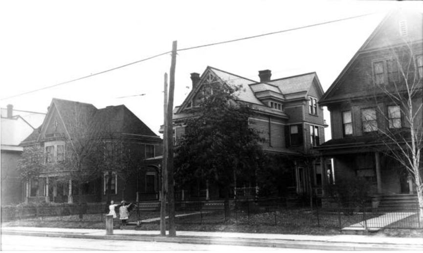
FIGURE 5: T. V. Powderly. Scranton, Pennsylvania. "Taken Nov. 1909 while at home to vote and on way back." Image by T. V. Powderly.

in September 1901 and succeeded by New York's Theodore Roosevelt who terminated Powderly from office on July 2, 1902 (see fig. 6). This was the result of the slanderous efforts of those Powderly had fired who in turn convinced Roosevelt that Powderly was himself corrupt and had actively conspired with Roosevelt's political enemy Thomas Platt. Powderly, however, waged a vigorous campaign to exonerate himself. 13 Following an investigation, Roosevelt reinstated Powderly in 1906 as a Special Immigration Inspector of the Department of Commerce and Labor charged to study the causes of emigration. After touring several European countries Powderly wrote a report advocating that American agents select prospective immigrants before they left their homes, travel with them on the ships bringing them over, and evenly distribute the arriving immigrants throughout America (see figs. 7 and 8). 14