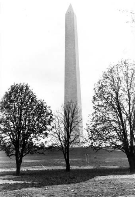
FIGURE 15: Washington Monument, April 16, 1912.