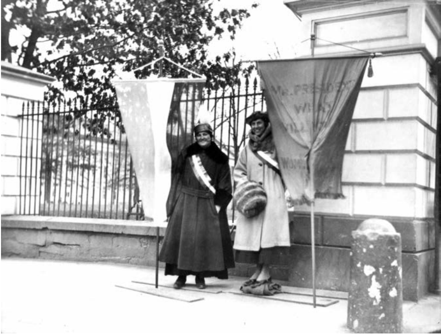
FIGURE 17: "Suffragists on Picket Duty before the White House," January 11, 1917. TVP (0285-11).