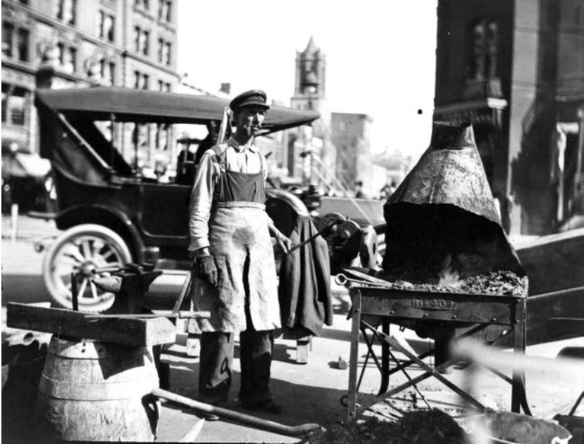
FIGURE 12: Blacksmith (with “hand forge”), 14th and G streets in DC, October 1913.