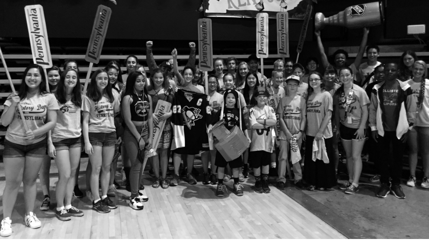
FIGURE 7 Parade group photo.