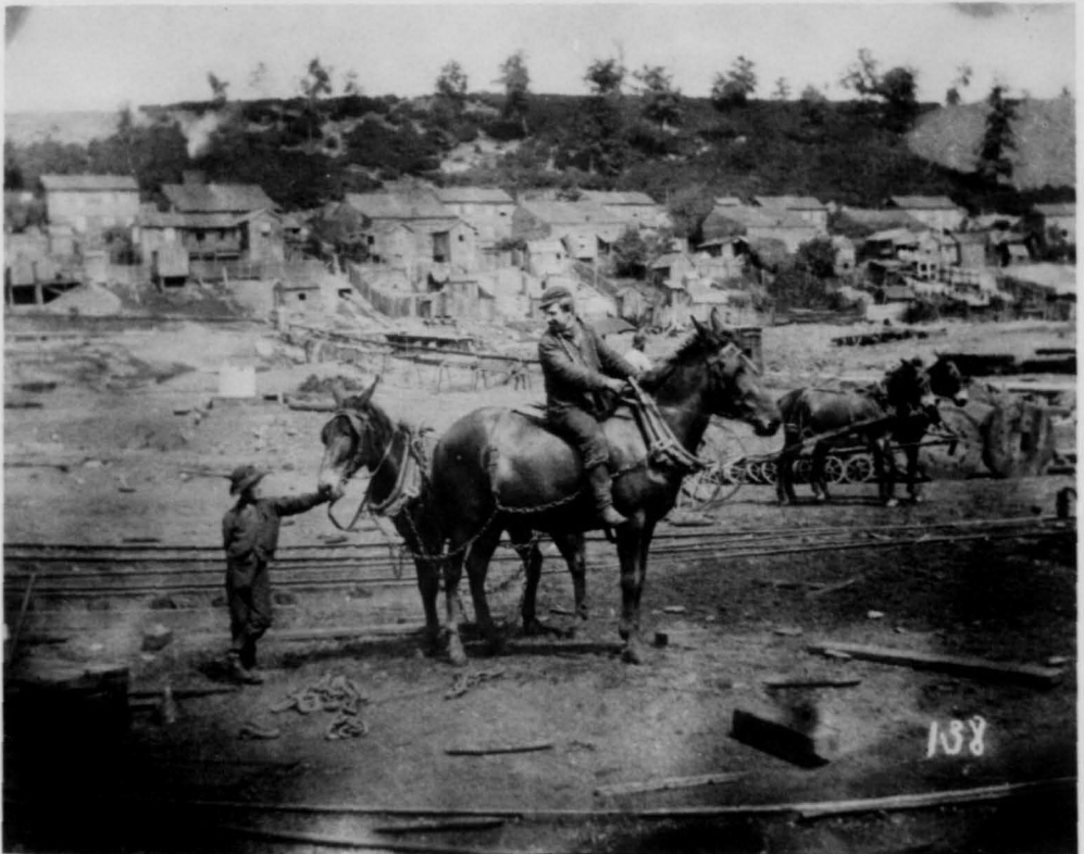
A quiet moment in the Anthracite region, ca. 1900.