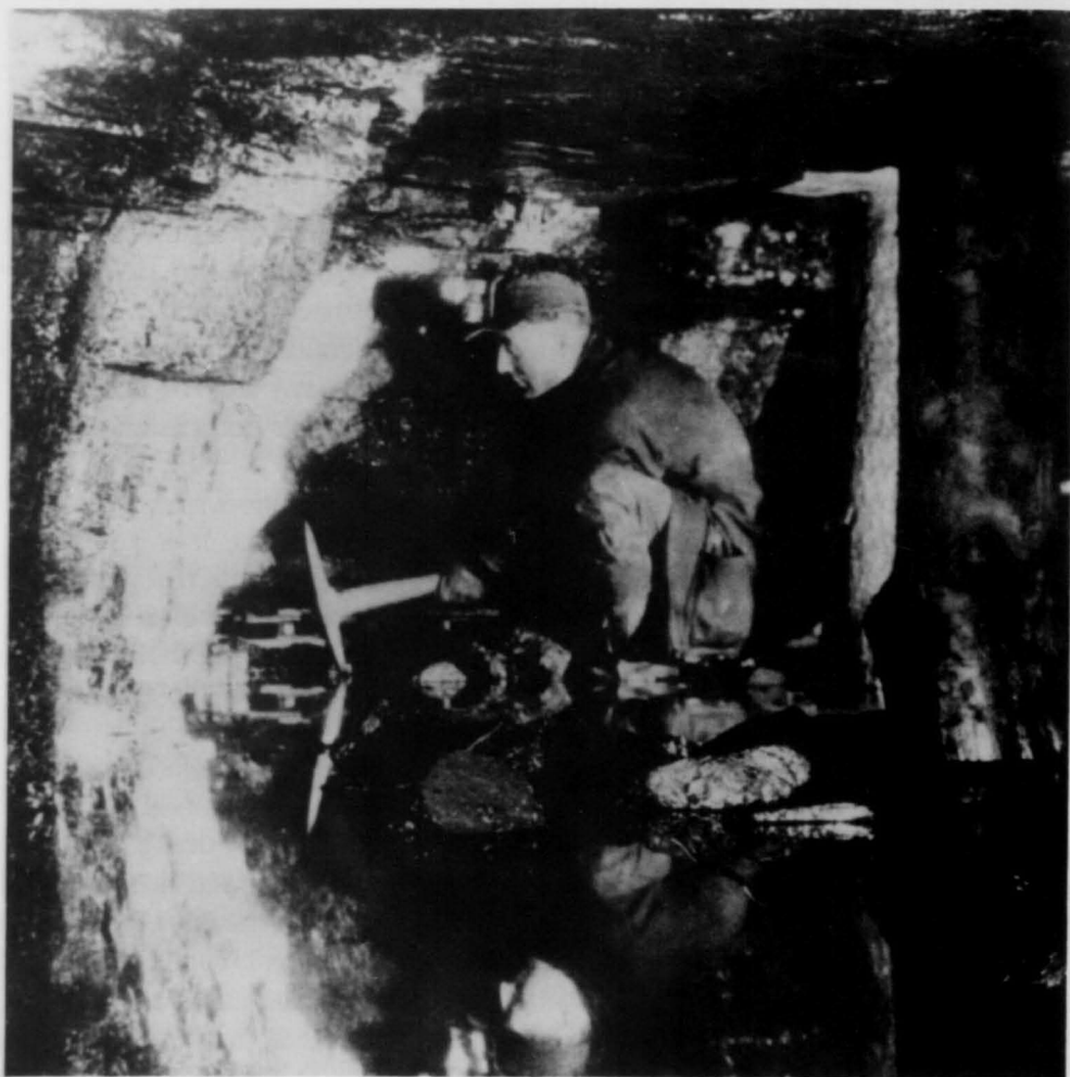
A mine at work in the Anthracite coal fields, ca. 1900.