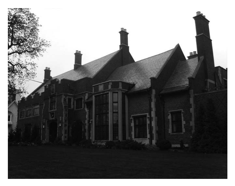
FIGURE 6: The Saturn Club. This building, on Delaware Avenue in Buffalo, was the site of the infamous raid on August 23, 1923. The Saturn Club is still in operation today.

A notorious raid occurred in one of Buffalo's most prestigious social clubs, the Saturn Club, which had a large membership by the Prohibition era. During this time some of its members secretly drank booze while enjoying the perks of membership. This practice took a hit on August 23, 1923, when an unmarked police car arrived at the club. The dry agents arrested a bartender and seized twelve quarts of whisky, twenty quarts of gin, a few gallons of grain alcohol, and several bottles of champagne. While this raid was to the delight of the Anti-Saloon League, it was met with scorn and disdain by many Buffalonians. During their raid, the dry agents went into the personal lockers of Saturn Club members. Not only were many Buffalonians appalled by the raid itself but some were further enraged by this foray on the lockers