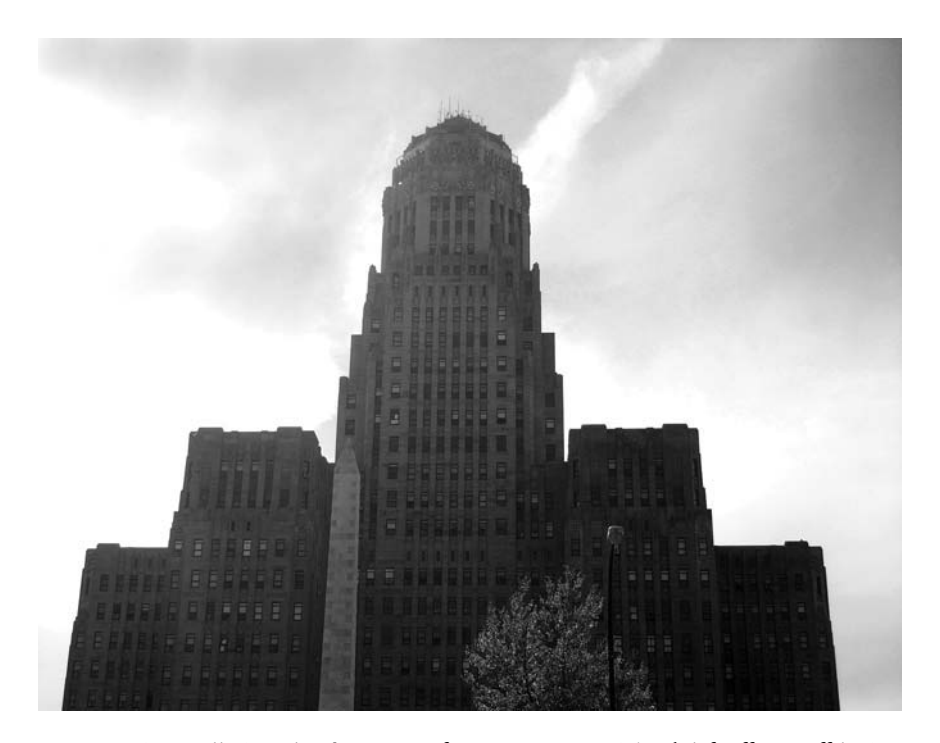
FIGURE 4: City Hall. Completed in 1931, after Mayor Francis Schwab left office, Buffalo City Hall was open during the last few years of Prohibition. It remains one of Buffalo's defining buildings in its downtown district. (Author's personal collection.)

alcohol and other toxic substances. The man who purchased the gin from the redistiller consumed it, and died from the toxins a few days later. The defense argued that the redistiller was liable because he claimed the gin he sold was grain alcohol when it was in fact a toxic form of wood alcohol. Evidence suggested that the defendant determined the alcohol had been toxic prior to selling it and before the man had consumed it. The judgment in this case pivoted upon timing. Had the defendant found out after he sold the liquor that it had been toxic the jury might not have convicted him. However, since the defendant knowingly sold the poisonous liquor, the jury sided with the plaintiff. The evidence was enough to find the man guilty and the judge sentenced him to fifteen years in prison.<sup>57</sup> Court cases such as these set the legal boundaries in which Buffalo redistillers operated. By understanding and conducting their business within this framework, redistillers were able to continue their operations throughout the life of Prohibition.