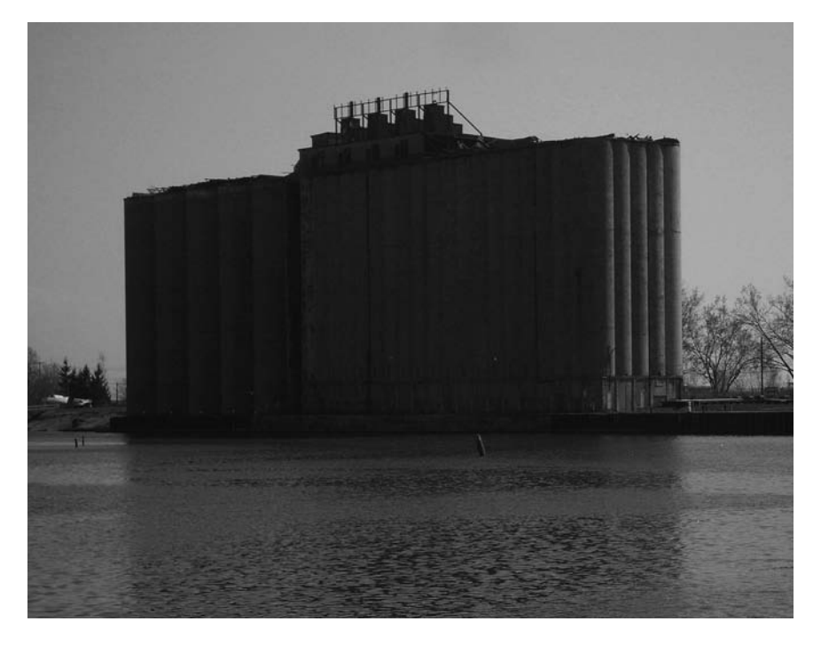
FIGURE 3: Grain elevator. The grain elevators in Buffalo became a centerpiece of the city's thriving grain industry, which contributed to the brewing industry.

the abundance of breweries predate the homebrewers, but it foreshadows their rise to prominence during Prohibition.