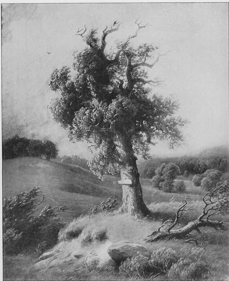
BRADDOCK'S GRAVE FROM PAINTING BY PAUL WEBER, 1854