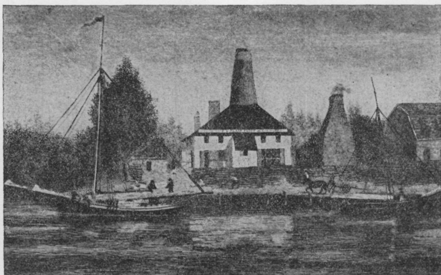
A View of Part of the Union Glass Company's Works, Kensington near Philadelphia

of 1828 confirms the making of cut glass in Philadelphia at that period.