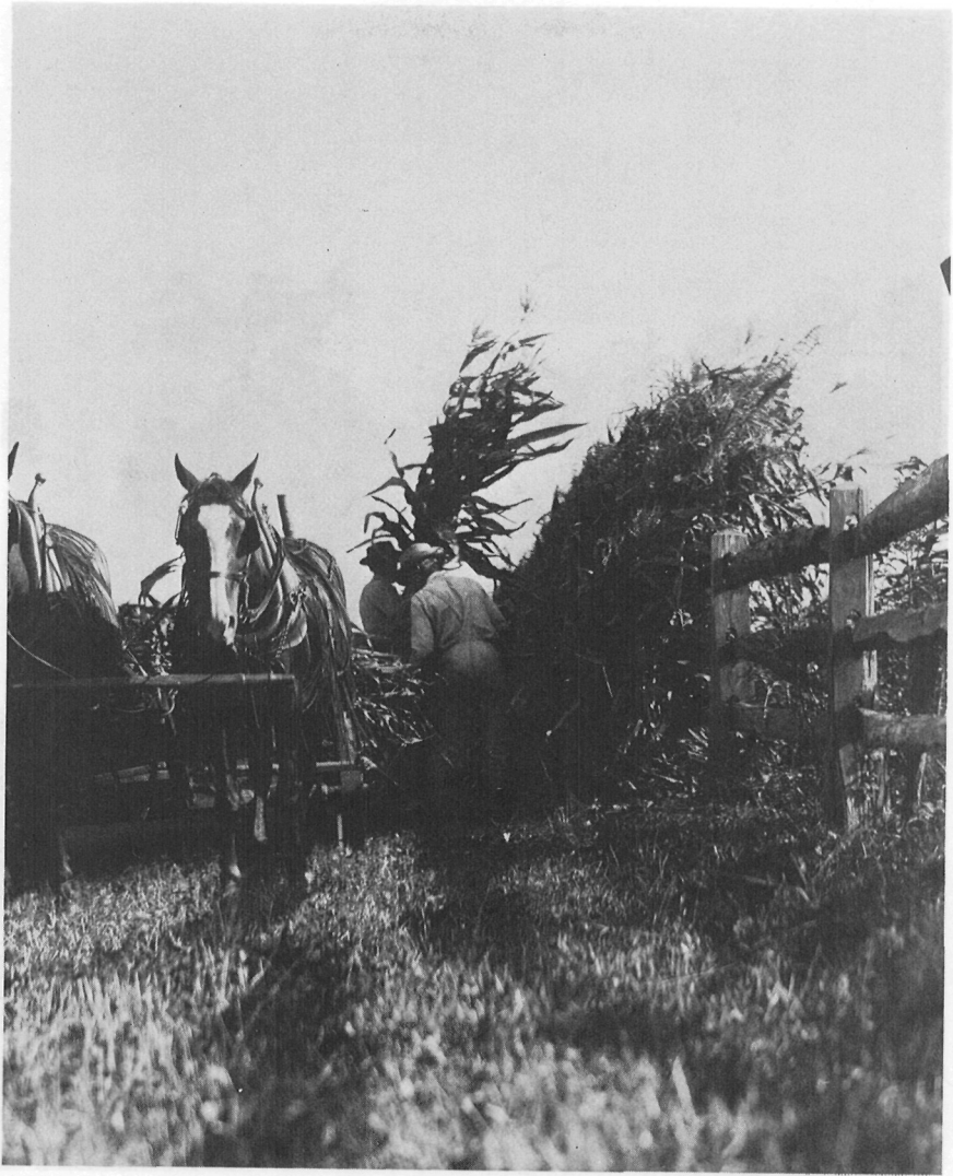
Men loading corn