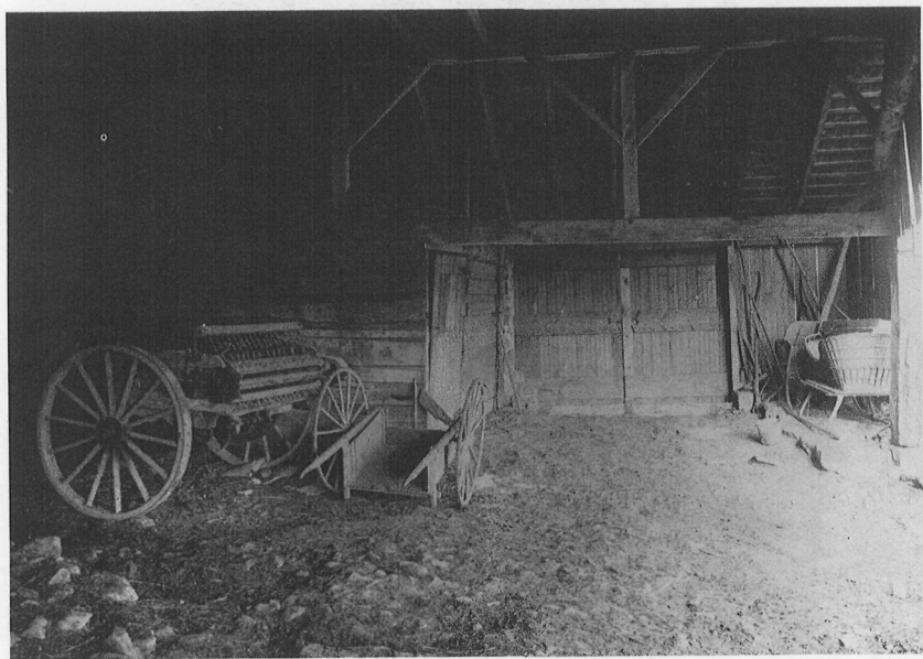
Barn near Marple