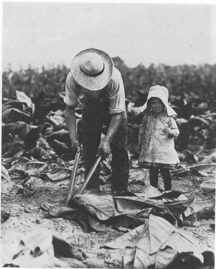
Small girl with man cutting tobacco