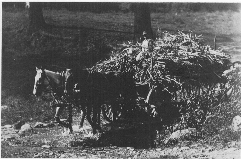
Horses pulling loaded wagon