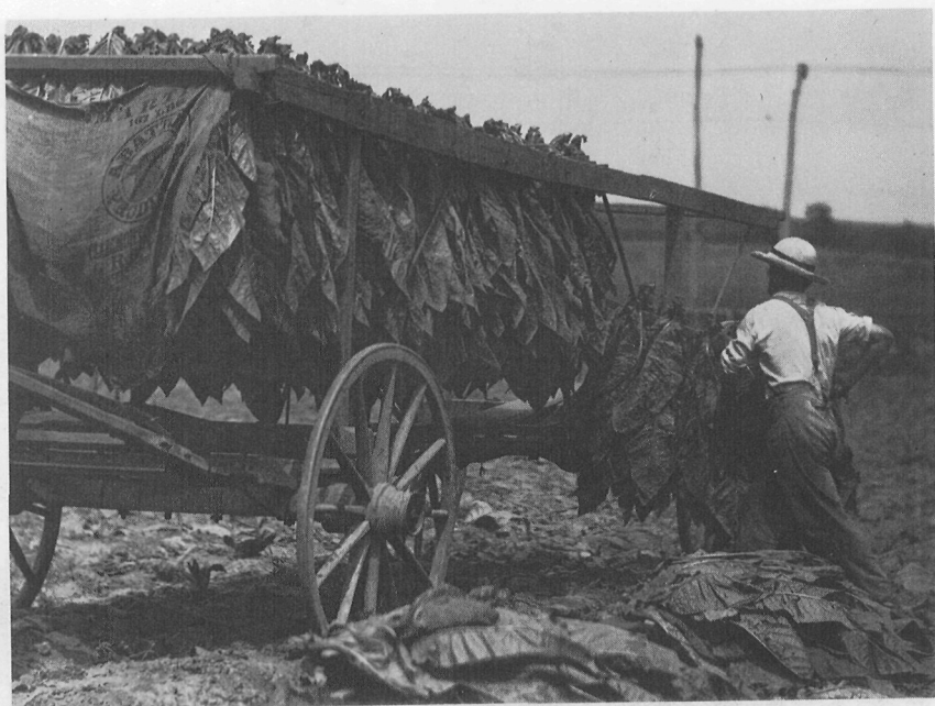
Man loading tobacco