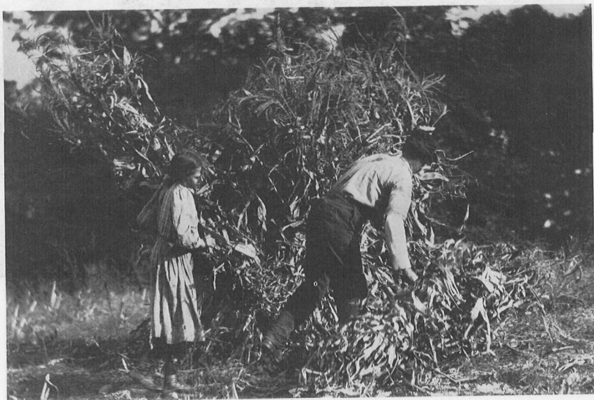
Man cutting corn