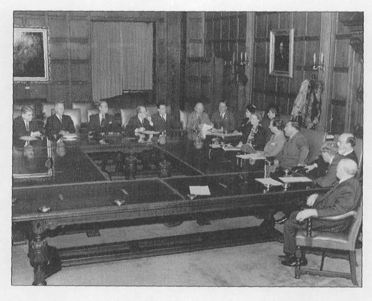
The board of directors of the Stage Door Canteen, meeting at the Pennsylvania Company, 15th and Chestnut Streets. Philadelphia, October 1945.

canteen were those in uniform.<sup>40</sup> The committee further justified their decision by explaining that "the Canteen was established strictly for service men, and other recreational centers are being established to take care of the women in service." Responding to this double standard, a WAC lieutenant visited the canteen to personally request that servicewomen be admitted. She suggested that perhaps servicewomen might serve as junior hostesses who were in short supply, explaining that off-duty WACs were not required to wear uniforms after 4 P.M. The lieutenant added that although it was quite true that other facilities were being developed for these women, the recreational facilities that currently existed were very limited.<sup>42</sup> The final