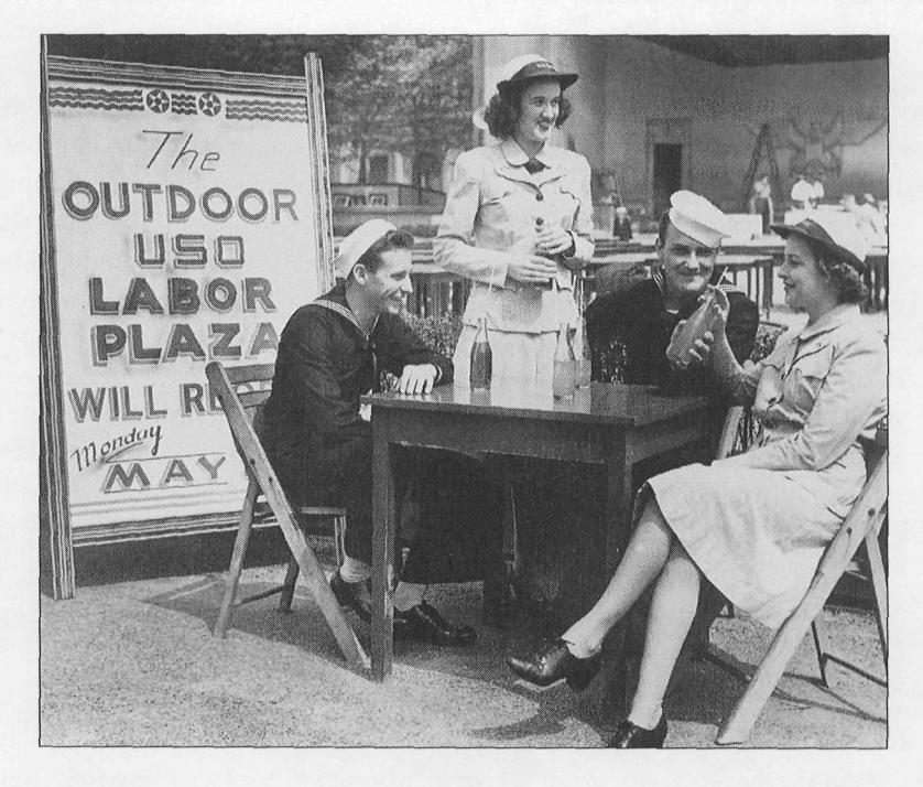
Servicemen and -women at the USO Labor Plaza. Philadelphia, ca. 1944.

Regardless of these limitations, women in the military served as vivid examples of the power of war to reshape the gender roles that were firmly entrenched in the 1940s. This defiance led to efforts by traditional forces