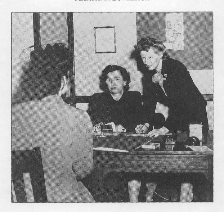
Interviewing a prospective junior hostess. Philadelphia, ca. 1944.

clearly indicated the qualifications. "We want them pretty. We want them young and unmarried. We want to be sure they dance well." A junior hostess had first "to win the approval from the discerning eye of a committee of personnel chairmen" who reportedly had lived in Philadelphia long enough to know a pretty girl when they saw one. After her selection a hostess was expected to be constantly mindful of her duty to take "the loneliness out of the war for the men in the armed forces of our country." Encouraged to wear short skirts or dresses of gay prints or dark sheers brightened with vivid shades, the canteen women were "requested to look as feminine and pretty as possible," keeping in mind "that boys appreciate