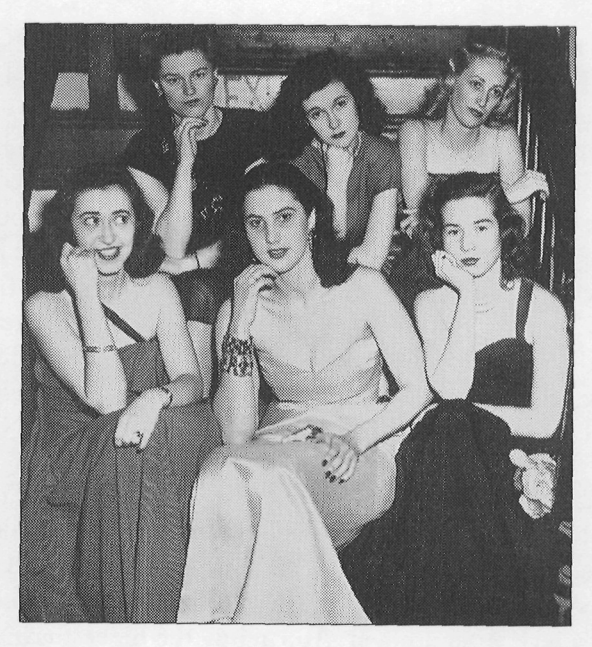
Junior hostesses on duty at the Stage Door Canteen. Philadelphia, ca. 1944.

dainty frills in girls' dress."<sup>49</sup> Considering these priorities, it is hardly surprising that servicewomen and defense workers were unwelcome. They were simply incompatible with the traditional gender images which canteen officials wished to portray: the handsome, brave soldiers who risked their lives to protect the pretty, helpless girls back home.