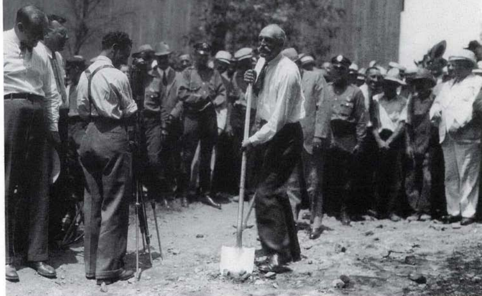
Governor Gifford Pinchot at a groundbreaking ceremony for a new road in York, one of many that came to be called "Pinchot roads."