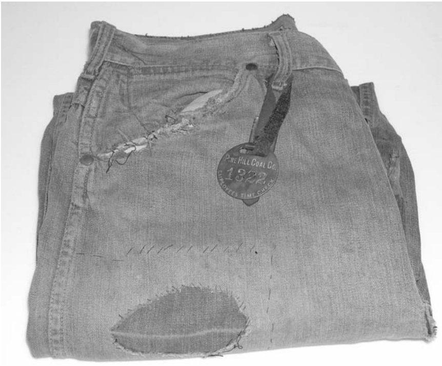
Fig. 1. Bill Keating's pants, item MHI-MN-8993C, accession 262096, Division of Work and Industry, National Museum of American History, Smithsonian Institution.