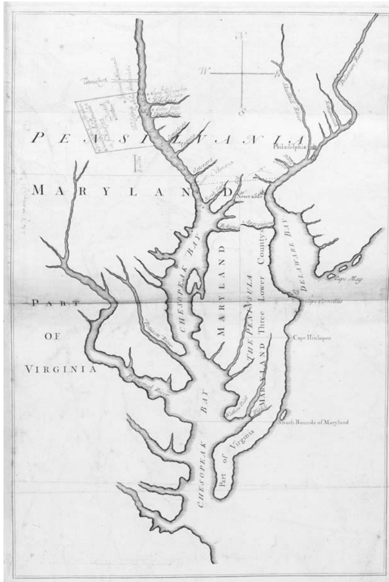
Map of the boundaries as drawn for the Agreement of 1732 with annotation showing location of Cresap, Ross, Wright, and Blunston's properties as well as the "Dutch" settlement. NB-003, folder 6, ser. 11, Penn Family Papers, Historical Society of Pennsylvania, http://digitallibrary.hsp.org/index.php/Detail/Object/Show/object_id/8534 .