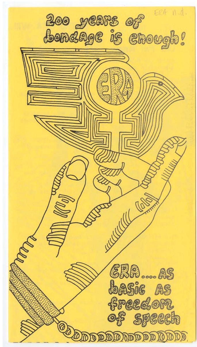
Brochure in support of the Equal Rights Amendment, 1976. Box 1, National Organization for Women, Philadelphia Chapter Records, Historical Society of Pennsylvania. http://digitallibrary.hsp.org/index.php/Detail/Object/Show/object_id/8084