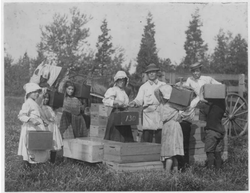
Group of Children Carrying in Their Pecks to the “Bushel Man,” Theodore Budd’s Bog, near Pemberton, New Jersey, 1910.

Many workers in the cranberry bogs of central New Jersey were migrant laborers from Philadelphia who traveled up and down the East Coast following the various fruit and vegetable harvests. According to surveys by the National Child Labor Committee, entire families left their tenement homes together, worked side-by-side in the fields, and pooled their earnings at the end of the harvest season. Hine often kept meticulous notes regarding his photograph subjects, including their names and exact streets of residence in Philadelphia. Based on this information, we know that many of the migrant laborers in the New Jersey cranberry bogs hailed from the Ninth Street—or Italian—Market section of South Philadelphia.