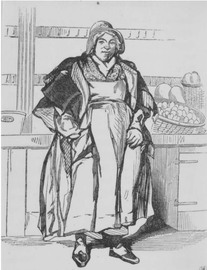
"The Huckster," City Characters; or, Familiar Scenes in Town (Philadelphia, 1851), 56, Historical Society of Pennsylvania. http://digitallibrary.hsp.org/index.php/Detail/Object/Show/object_id/10353