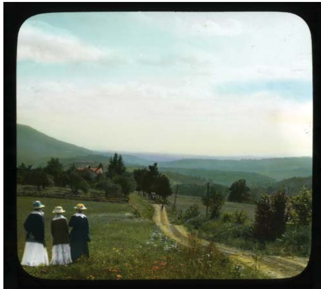
Fig. 2. Road from Laporte . Manuscript Group 85, J. Horace McFarland Papers Lantern Slides. Courtesy of Pennsylvania Historical and Museum Commission, Pennsylvania State Archives.

to be less intellectually demanding than treatments that highlighted the natural world's indifferent power, overwhelming size, and routine violence. The "higher" levels of outdoor perception, especially versions of the natural sublime, were the domain of men. When McFarland took such a picture, then, he literally illustrated his attempt to get more Pennsylvanians thinking about the prettiness of their state as an asset. This included a professional class of city-dwelling men. The men above Forksville illustrated a movement that fascinated McFarland: shifting back and forth from the wild abandon of cars to the solemnity of the roadside. A. H. Beardsley, the editor of Photo-Era's "Crucible" department for savvy technicians, observed in late 1919, "It is astonishing to note the number of amateur photographers who fail to use automobile-trips to photographic advantage." Beardsley shared with McFarland a consumer's mentality, through which any drive became a chance to "obtain much valuable picture-material." He warned readers that if they were passengers, and not behind the wheel, they would contend with the driver's zeal to complete the trip as quickly as possible. McFarland recognized "picture-material" when he saw it. He subdued the background of the image by making the men, the