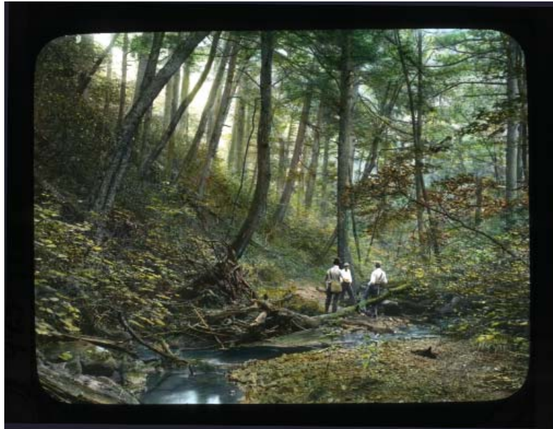
Fig. 6. Primeval Forest . Manuscript Group 85, J. Horace McFarland Papers Lantern Slides. Courtesy of Pennsylvania Historical and Museum Commission, Pennsylvania State Archives.

Primeval Forest shows men at ease within a landscape instead of beholding it from afar. They have gotten to the bottom of things, as it were, and for a while there are no more spectacles to appraise. The photographer makes their pause in the creek bed a subject of interest, and the discrepancy in size between the men and their surroundings conveys the scale of the woods and the possibility of quiet moments in every dip. The forest does not appear large enough, however, to evoke the God-fearing emotions usually associated with the sublime. This is the “woodsy” forest, a term McFarland used to define city dwellers’ estimation of a forested area that looked right . It plays the part of stately backdrop for men’s actions. They had gotten themselves there, and they would soon hike back out, reaching the comforts of the resort well before dinner was served at the Forest Inn. McFarland, too, had shouldered his equipment down the trail to this site. The logistical ordeal of photography did not dictate a purely functional style, but rather contributed to a tendency of “probing, analyzing, and active observing” in the outdoors. McFarland portrayed himself as a master of this trinity, using patient contemplation to build a visual vocabulary. In this, he was in line with the photography columnists who