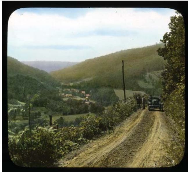
Fig. 1. Loyalsock Road . Manuscript Group 85, J. Horace McFarland Papers Lantern Slides. Courtesy of Pennsylvania Historical and Museum Commission, Pennsylvania State Archives.

Conventional picturesque landscape scenes placed an observer at a vista in the immediate foreground, allowing the viewer of the image to share in the perspective of the person at the site. To take this photograph, McFarland moved far enough away from the trio that the resulting image was as much about them embedded in the landscape as it was about the view that they took in. The situation he sought was this encounter between attentive tourists and the pleasant country. Locating the car in the middle distance allowed McFarland to highlight the vegetation lining the road as well as the trees and fields in the valley below. This image would have worked well as a part of his scenic preservation lectures; it encouraged viewers to imagine not only the scenery of such a drive, but also the thrill of the journey. McFarland rated the Loyalsock corridor's views as some of the best in the nation.