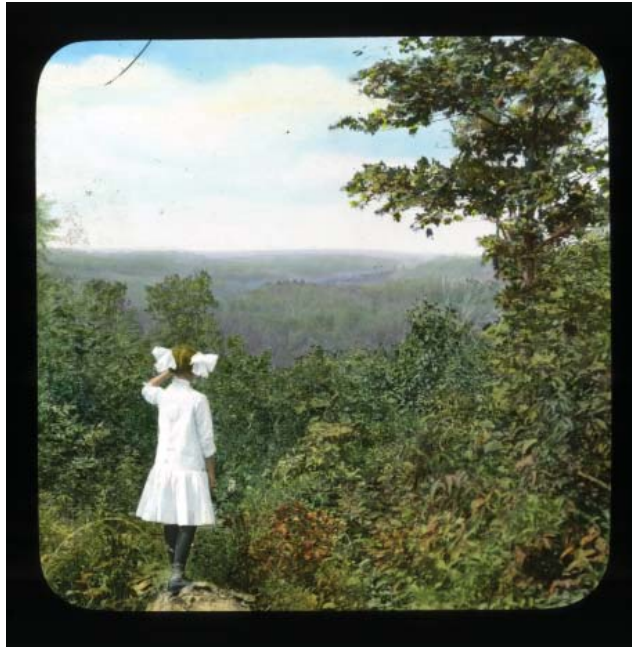
Fig. 5. Shanersburg View . Manuscript Group 85, J. Horace McFarland Papers Lantern Slides.

between the sky and foreground, so that neither of them dominate the other. 37