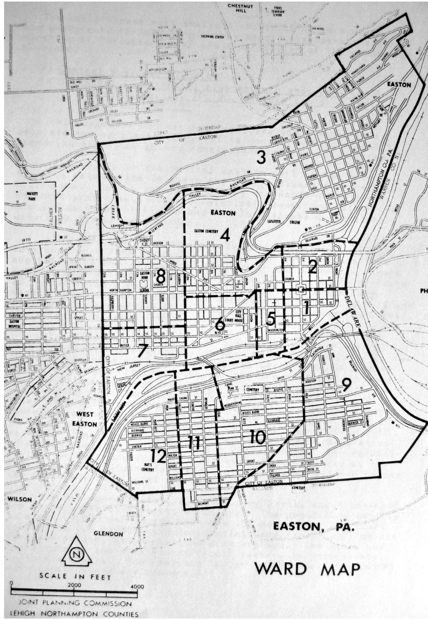
Fig. 3. Ward map from the “Easton Community Renewal Program Summary Report” (typescript bound report, Easton City Planning Commission, 1965), 22, Planning and Redevelopment Archives, City Hall, Easton, PA.