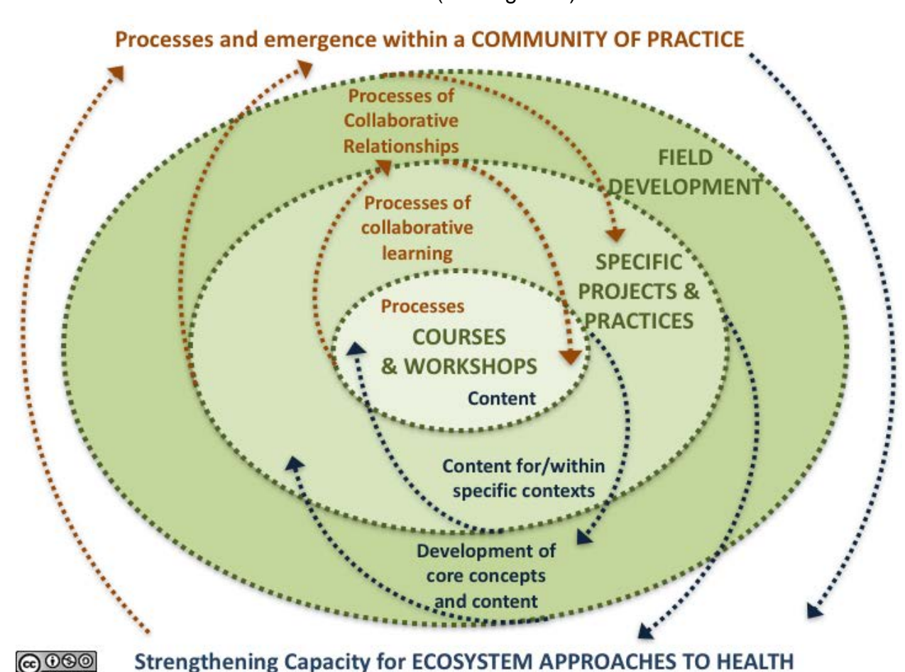
Figure 3: Nested, reciprocal relationships of collaborative processes & content learning: Insights from the evolution of CoPEH-Canada. Licensed under Attribution-NonCommercial-ShareAlike 4.0 International (<u>CC BY-NC-SA 4.0</u>). Legend: Green- nested activities (lighter within darker); Red – process dynamics & relationships between activities; Blue – content dynamics, regarding concepts and contexts.

Throughout the arc of activities developing and teaching ecosystem approaches to health, we noted an important reciprocal – and nested – dynamic between process and ecohealth content within CoPEH-Canada (see Figure 3).