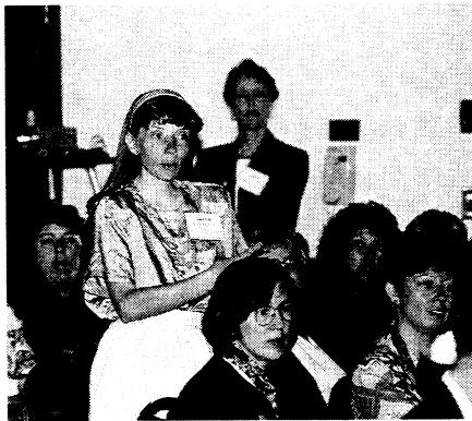
Conference participants discuss changes in technology-based industries.