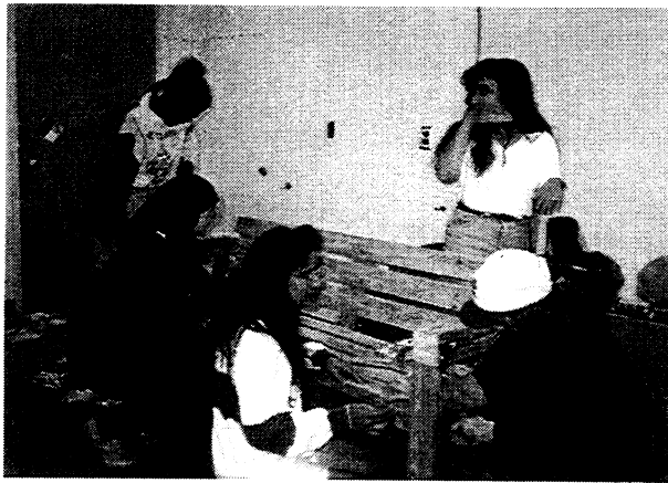
(b) Working Together as a Team