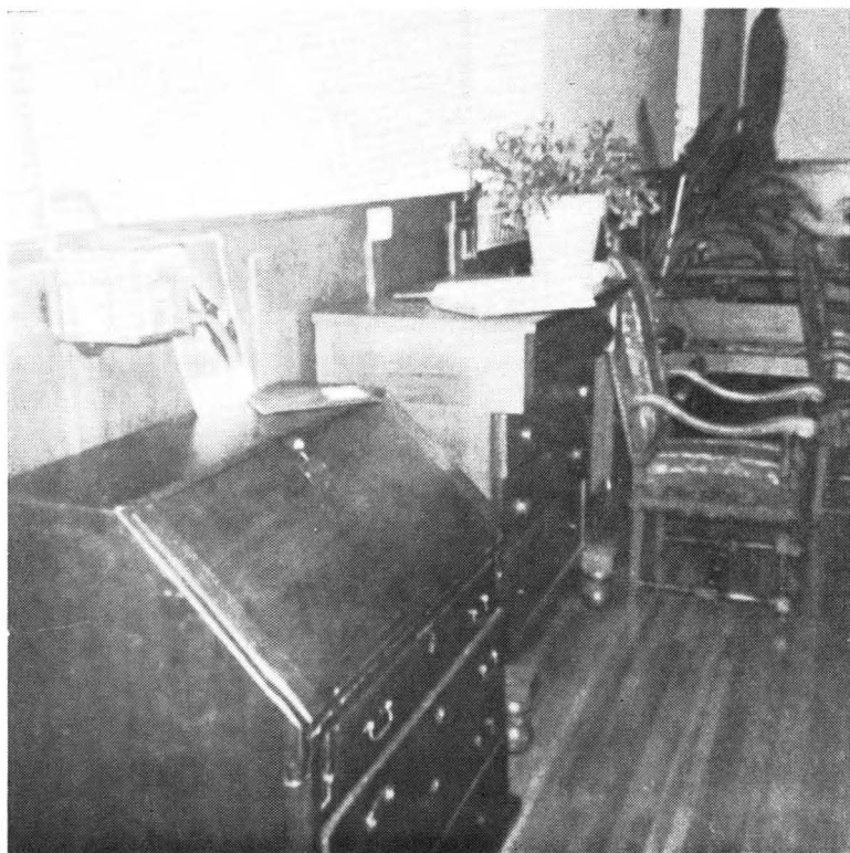
Furniture that Gallitzin used.