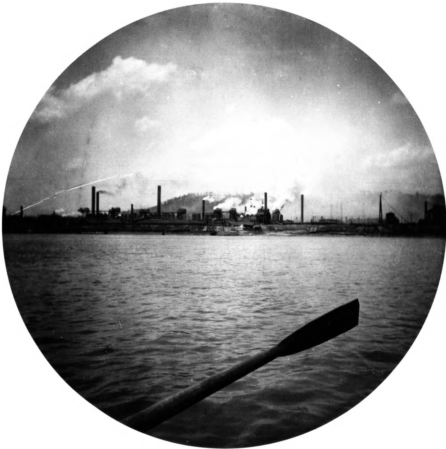
Andrew Carnegie's "ET" — the Edgar Thomson rail mill — from the Monongahela in Braddock, May 6, 1894.