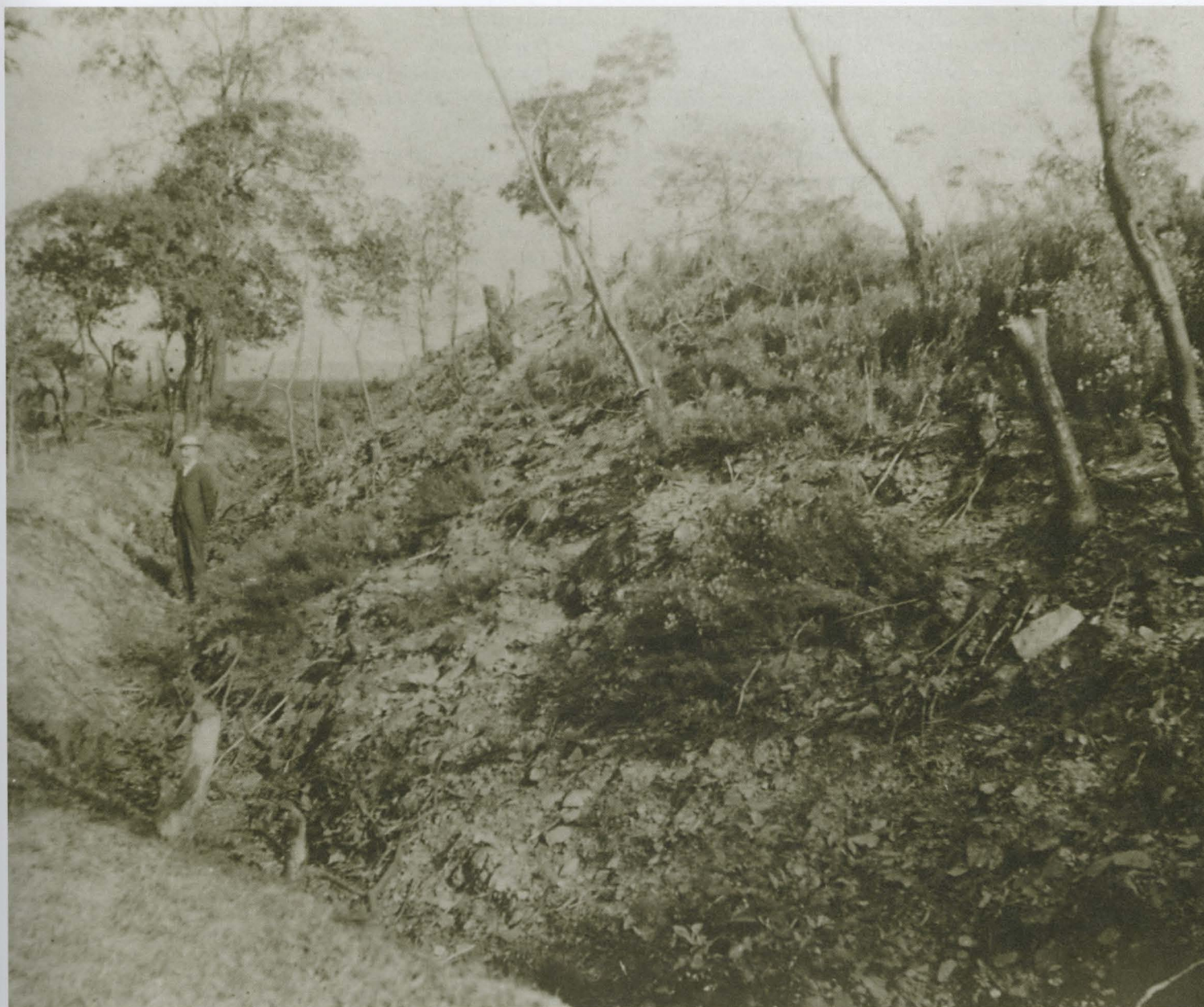
The photographer of this fort site in the 1890s reported that this redoubt was in St. Clair Township. Its exact location, however, is not certain.