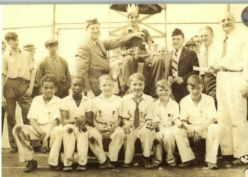
Gift of Douglas Opperman

The game is played within a ring 10 feet in diameter. Mibsters, or marbles players, try to knock 13 marbles out of the ring with a shooter marble, which must remain inside the ring after the shot has been played. The best players perfect a backspin to keep the shooter from straying outside the ring. Concentration is essential for success.