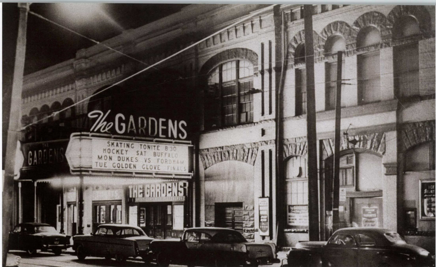
The fondly remembered Duquesne Gardens, North Craig Street in the Oakland section of Pittsburgh.