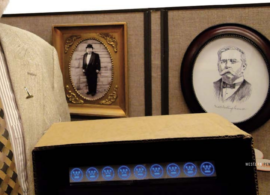
The History Center's Westinghouse Historian Ed Reis holds a model railroad-scale version of the Westinghouse sign.