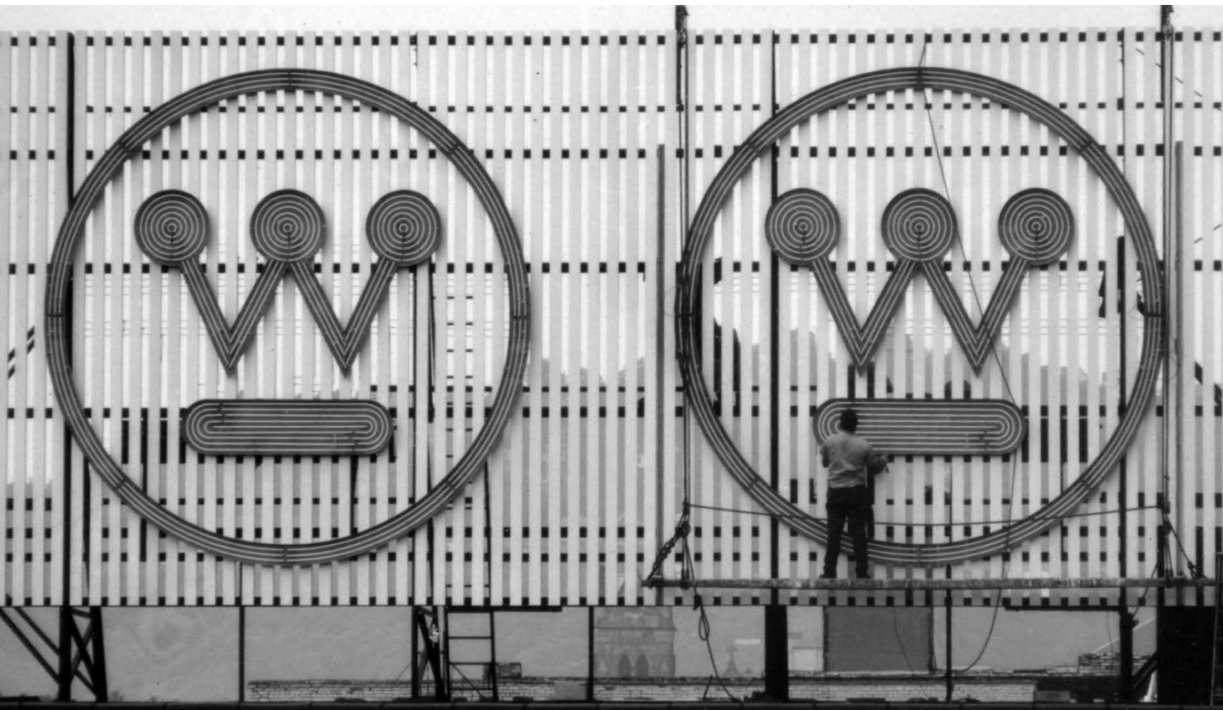
Assembling the sign in June 1967.