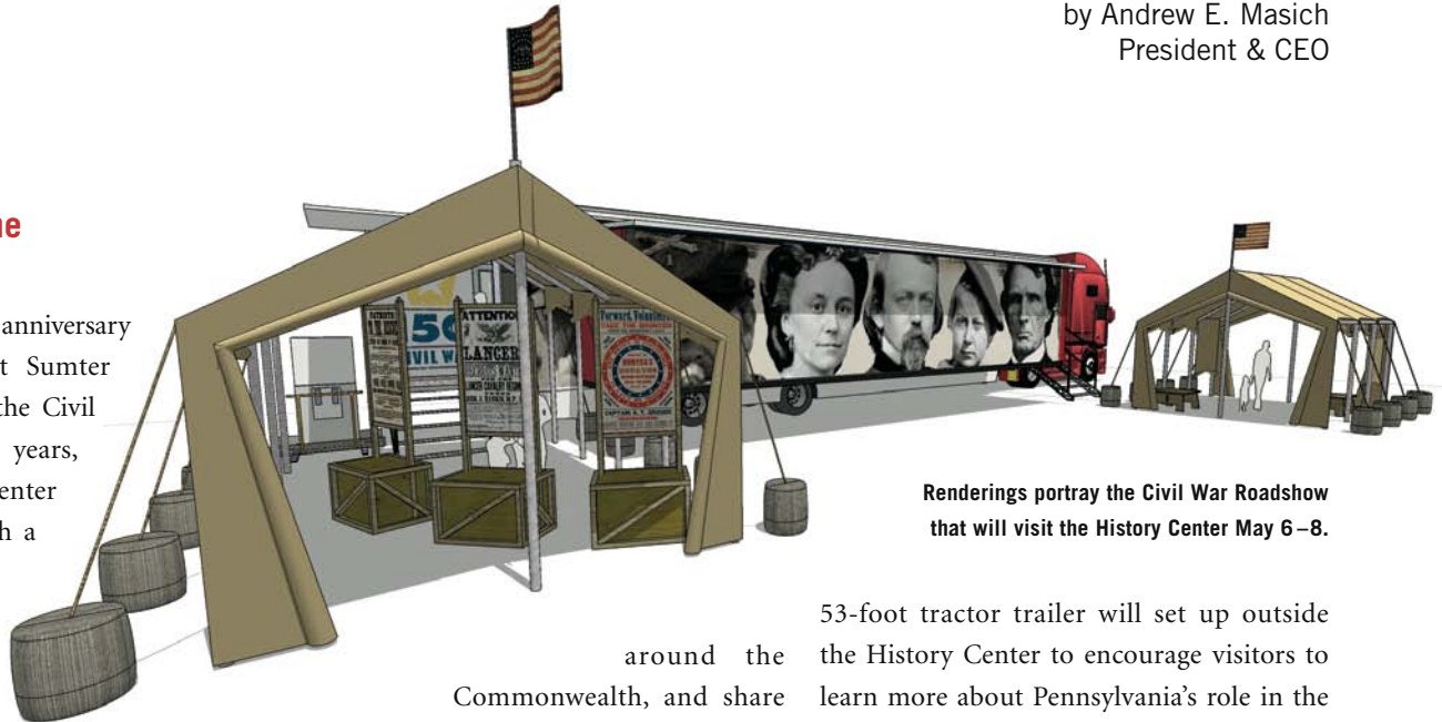
Renderings portray the Civil War Roadshow that will visit the History Center May 6–8.

Recently, the Pennsylvania Civil War 150 partners launched a new website commemorating the state's impact on the Civil War. Visitors can learn about upcoming Civil War-related events, browse hundreds of historic photos, learn about the efforts of women, immigrants, and African Americans in the war, plan trips