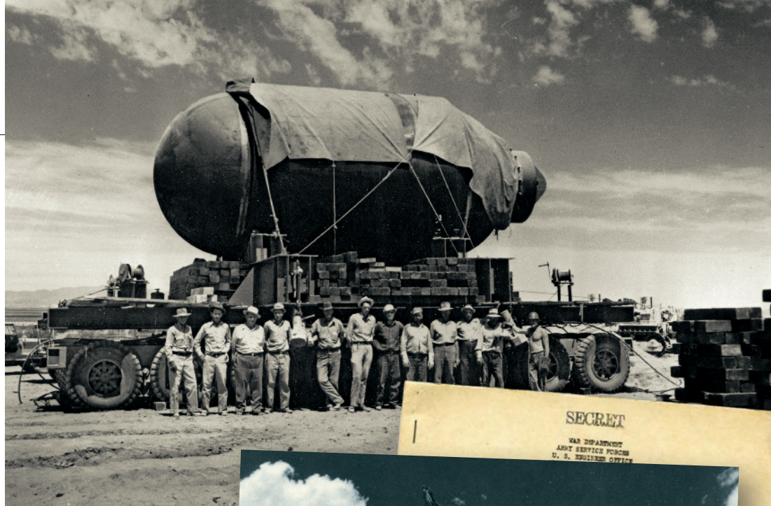
Eichleay employees from Pittsburgh with the trailer they built for Jumbo and the tower it hung from.

The Eichleay Corporation also built steel towers to hold the bomb aloft during the test. It was decided that Jumbo would be unnecessary but it would still be hoisted to a tower 800 yards from the blast (right). About 5:30 a.m. on July 16, 1945, the bomb was detonated; observers 10 miles away were