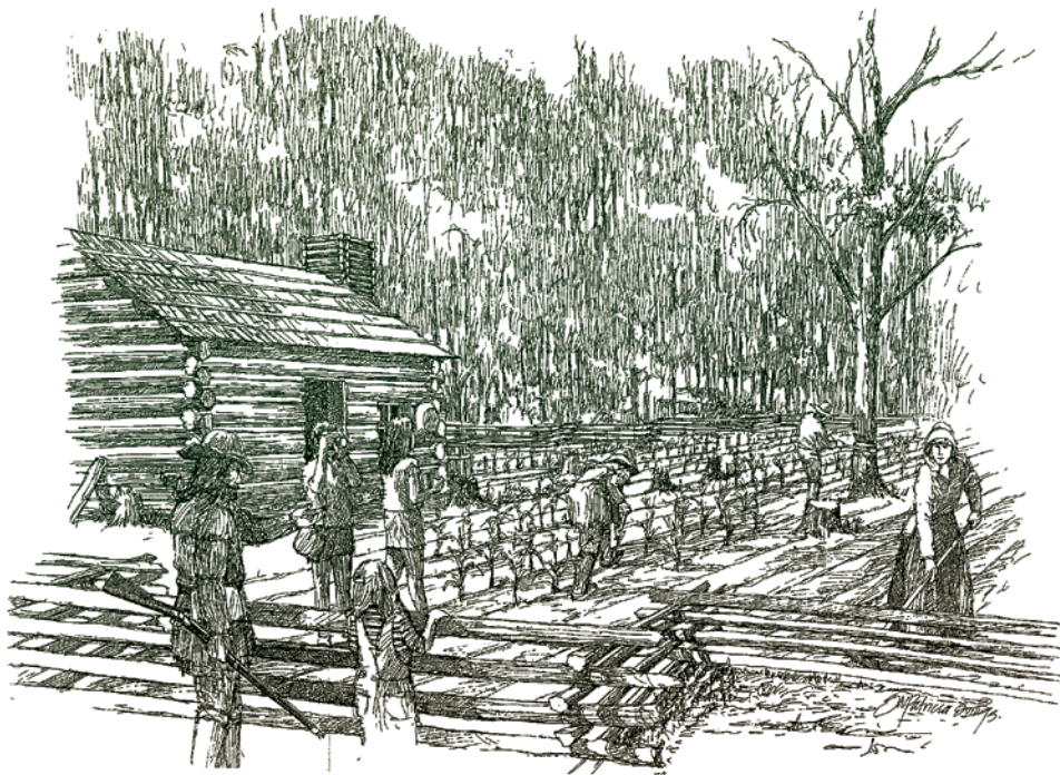
Sketch of a frontier farm by Steve Patricia, R.A.

Meadowcroft staff are developing an area to illustrate life in the upper Ohio Valley after European settlement. The 18th-century Frontier Farm complements the museum's 16th-century Indian village, where visitors get a glimpse of life before Europeans arrived, and the 19th-century village, which recreates the charming qualities of an upper Ohio Valley village. The new area will contain a settler's log cabin as well as a cabin representing the home of an Indian family. Meadowcroft is open Wednesdays through Sundays through Labor Day. The area and the associated educational programming are generously funded by a grant from the Claude Worthington Benedum Foundation.