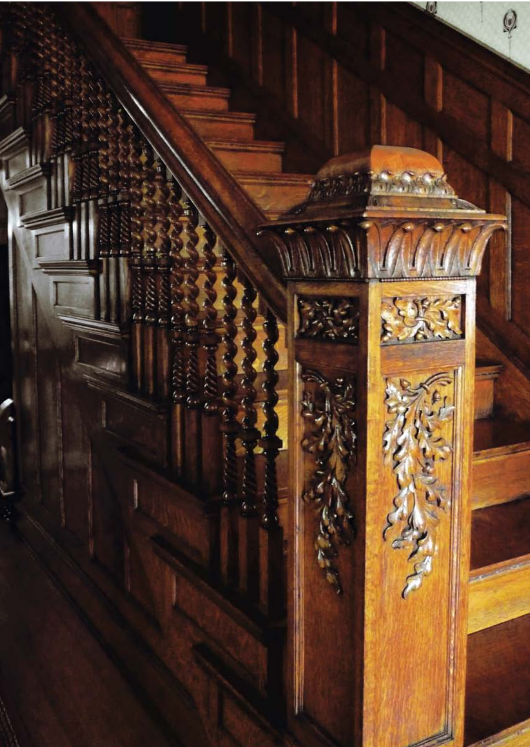
Stairway, railing, and newel post of Greer house.