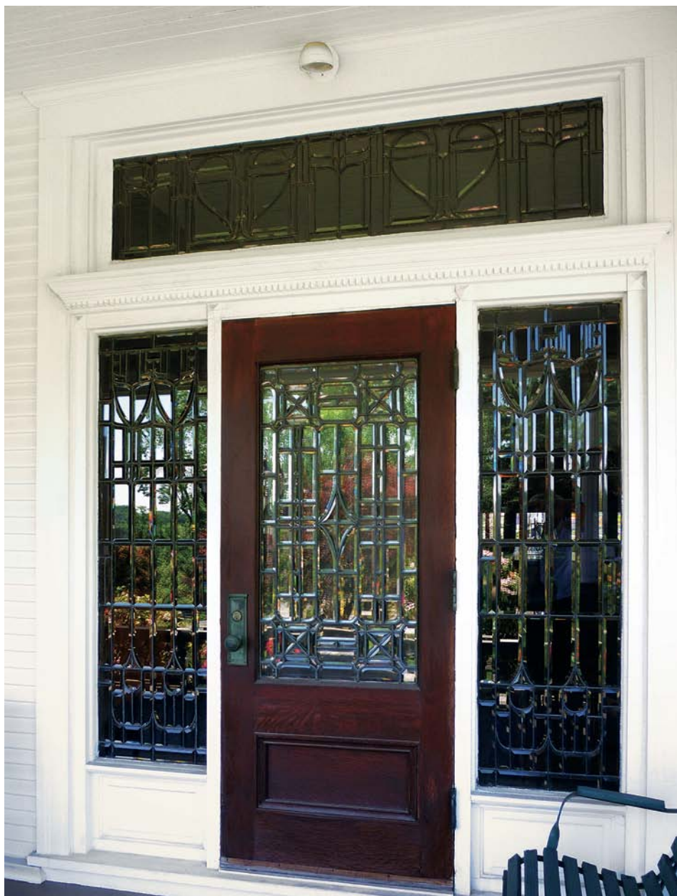
Dining Room doorway detail of leaded glass.