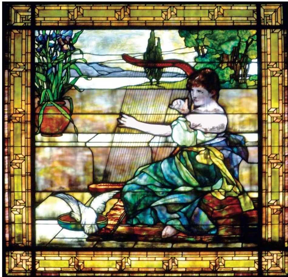
Stained glass window on stair landing of Greer house.