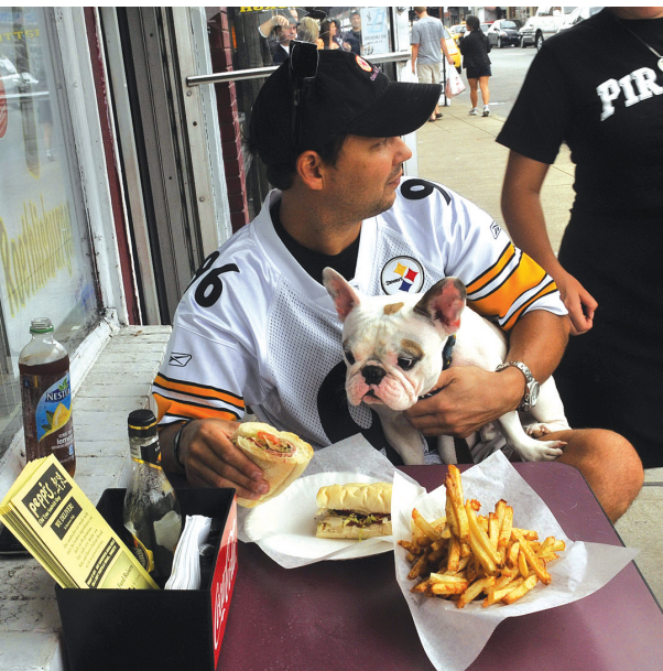
"Just a couple more inches...." A dog eyes up its owner's sandwich as they lunch in the Strip District on a fall afternoon. From The Year in Pictures 2011 .